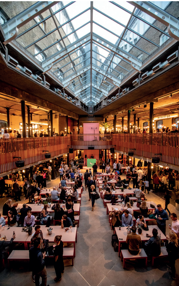
The eagerly anticipated Seven Dials Market by Kerb, which opened September 2019.