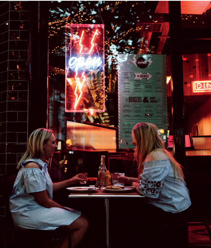
Food and Beverage at Seven Dials. Credit @SBR edits