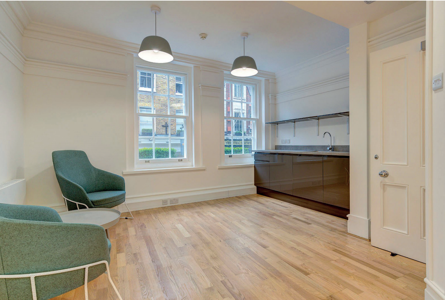
Kitchen & break out area