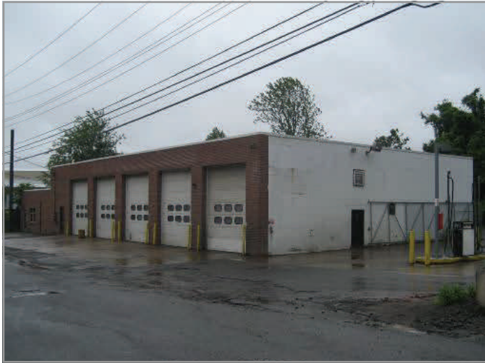
7,140 SF Building and Single-family house on total of 2.09 acres plus 1.74 acres vacant land

46, 50 & 64 Goodwin Street • New Haven, CT