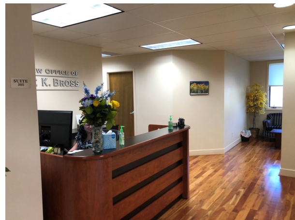
Upper Level Suite

101 N Cascade Avenue, Suite 200 | Colorado Springs, CO 80903 719.590.1717 main | 719.634.0404 fax | quantumcommercial.com