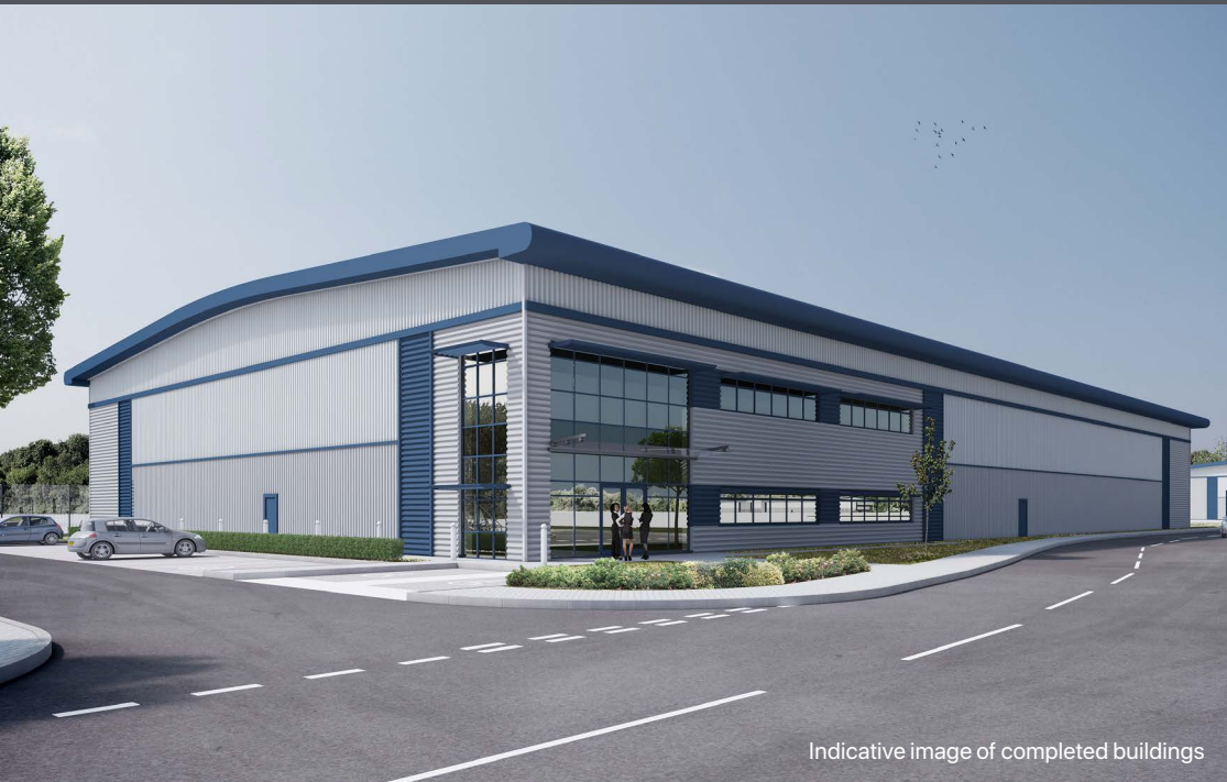
Indicative image of completed buildings

A brand new detached distribution unit with secure yard on the South West's Premier Distribution Park