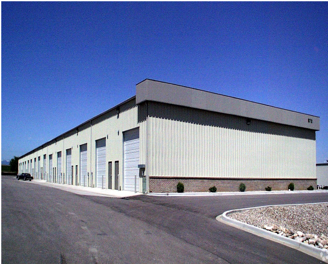
SOUTH FACING OVERHEAD DOOR