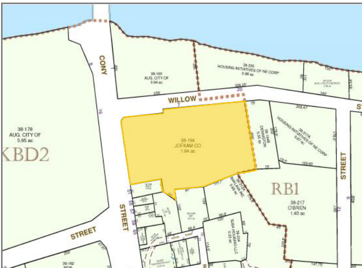
Portion of Augusta Tax Map #38 7 Willow St Lot #194 highlighted in yellow