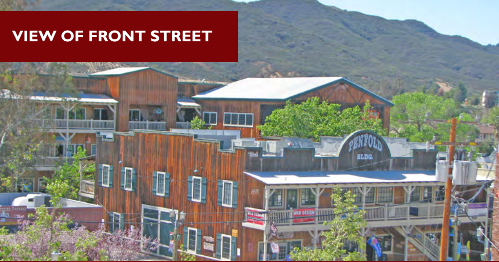
VIEW OF FRONT STREET