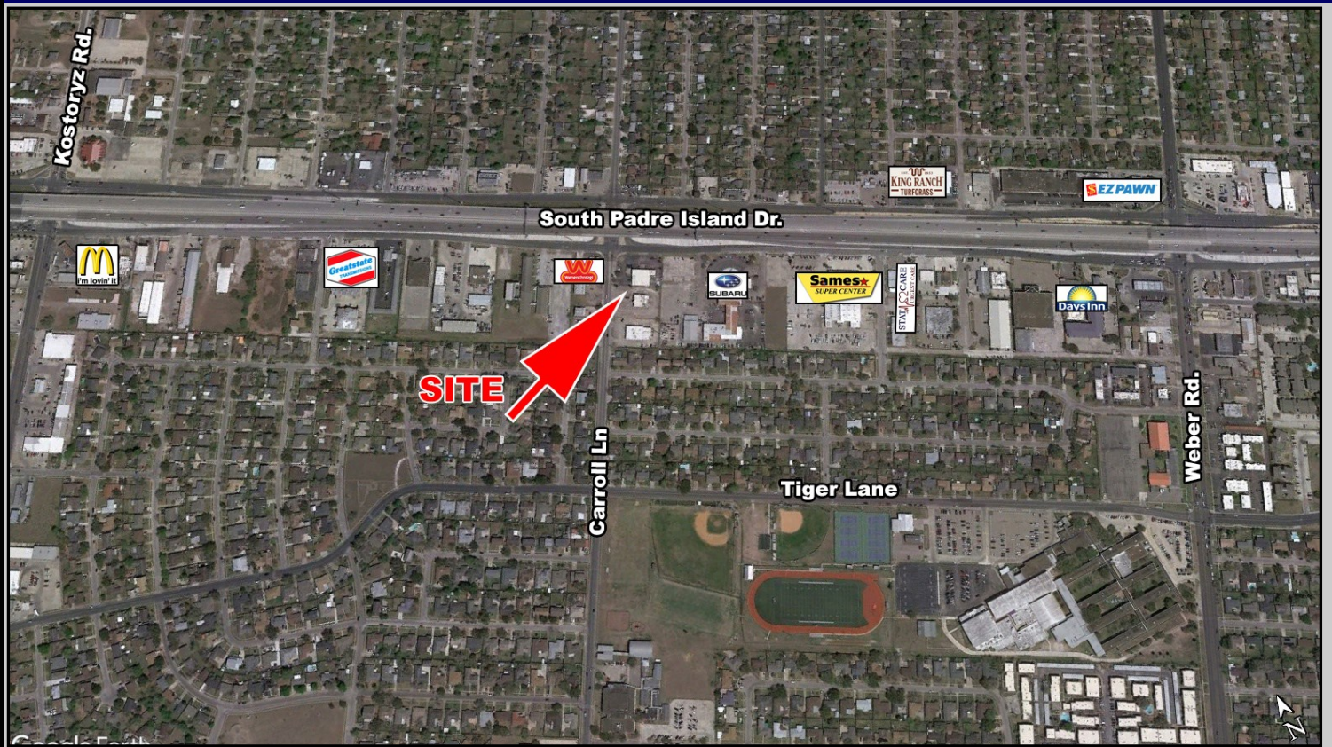
6,202 SF Building on South Padre Island Dr.