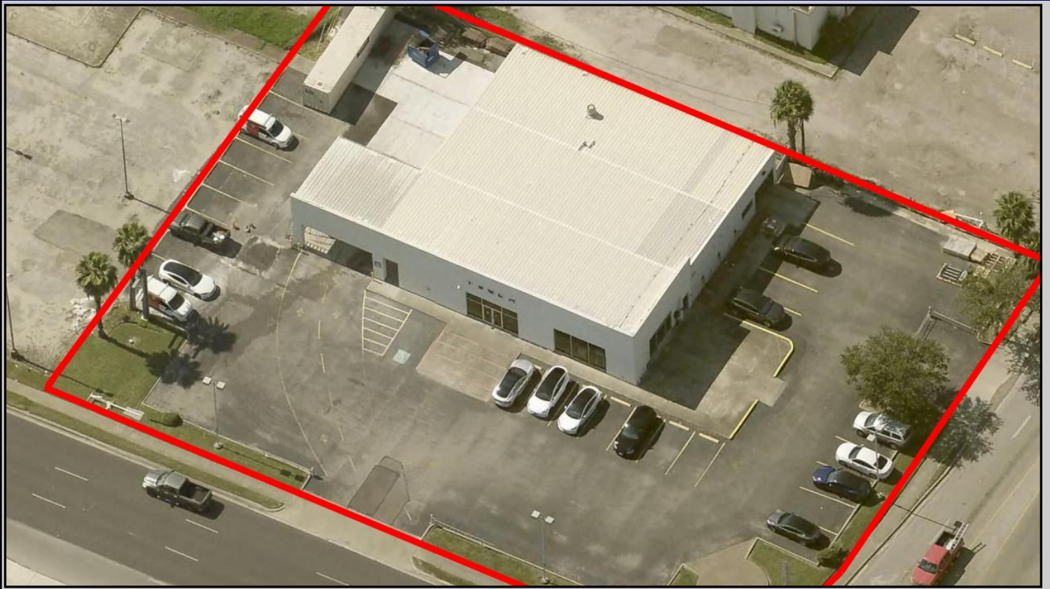
6,202 SF Building on South Padre Island Dr.