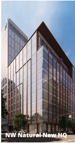
NW Natural New HQ

135 SW TAYLOR STREET PORTLAND, OREGON 97204