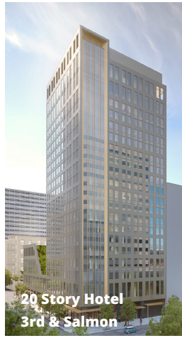
20 Story Hotel 3rd & Salmon