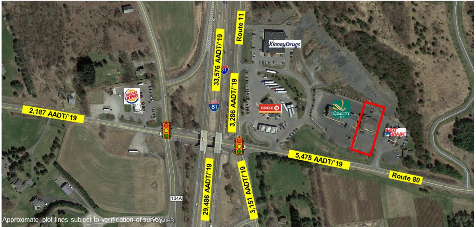
Approximate plot lines subject to verification of survey