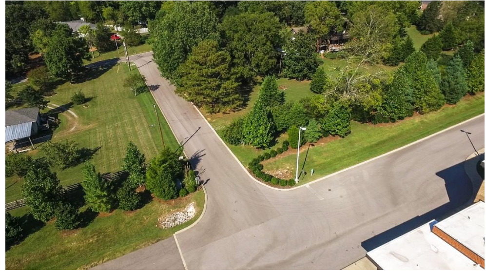
50' ROW off County Rd (direct access off of Franklin can be developed)