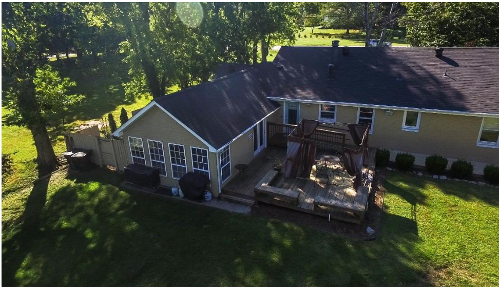
Office Building located on Franklin Rd ~ 2216 SF ~ 4/5 offices ~ Conference Room ~ 2 Full Baths ~ Full Kitchen