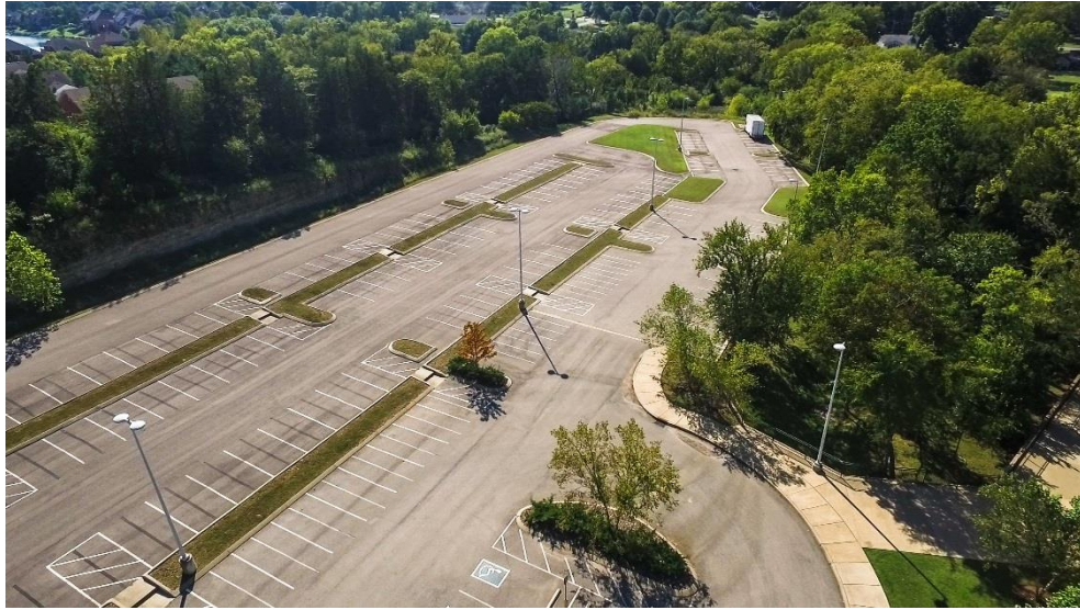
329 parking spaces