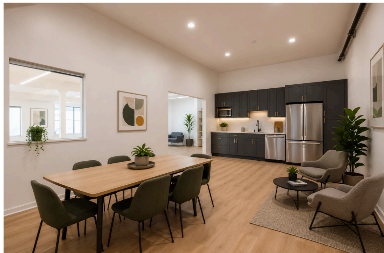
AI Generated Furniture