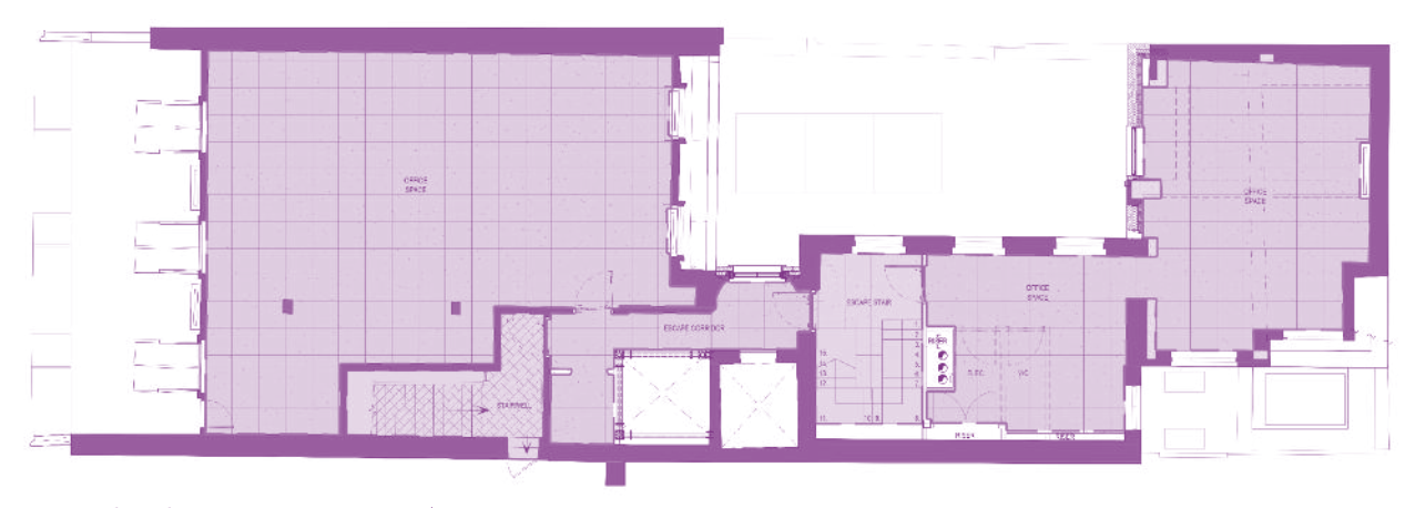
Fifth Floor 1,387 sq. ft | 128.81 sq. m