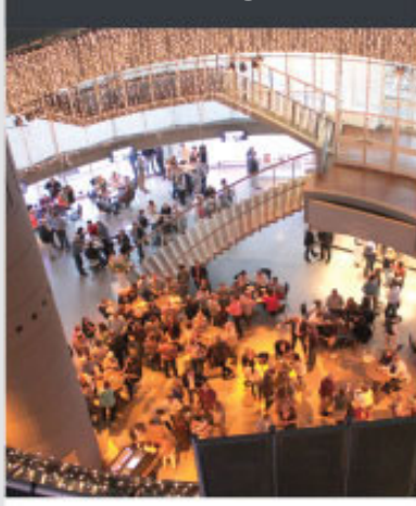
Connect with hundreds of people at our signature events