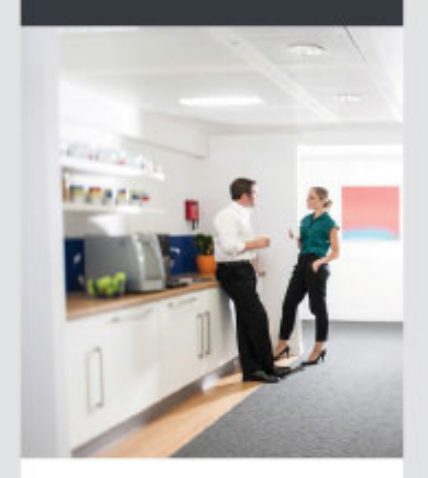
Chat over a coffee in a relaxed communal space