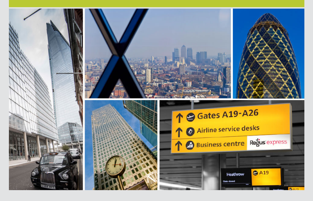
317 locations in UK