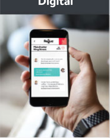
Connect with the Regus community using our social network