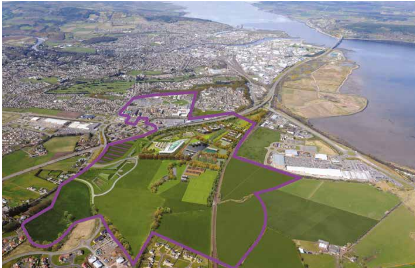
Aerial view - Wider Inverness Campus and city, 7N Architects

W www.invernesscampus.co.uk T +44 (0)1463 245245 E inverness.campus@hient.co.uk