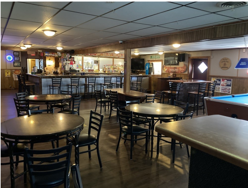
Main bar area