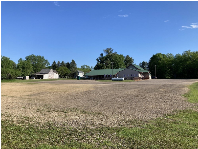
Large parking lot