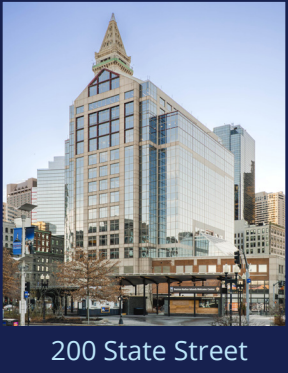
200 State Street