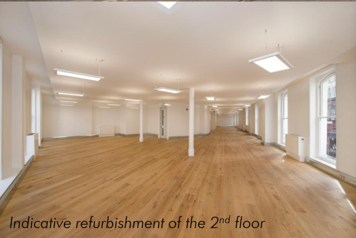
Indicative refurbishment of the 2 nd floor