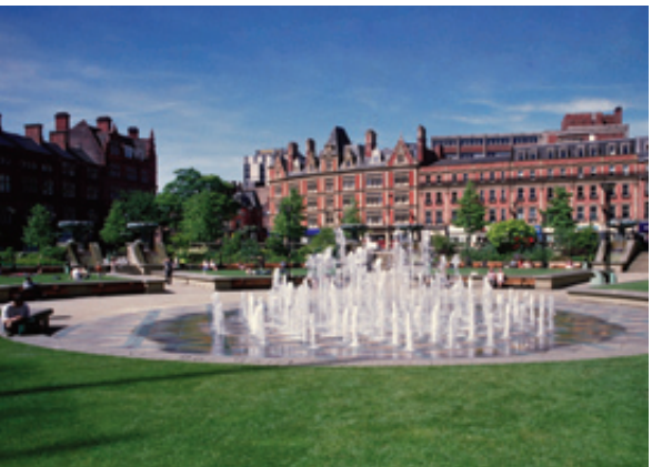
The Peace Gardens