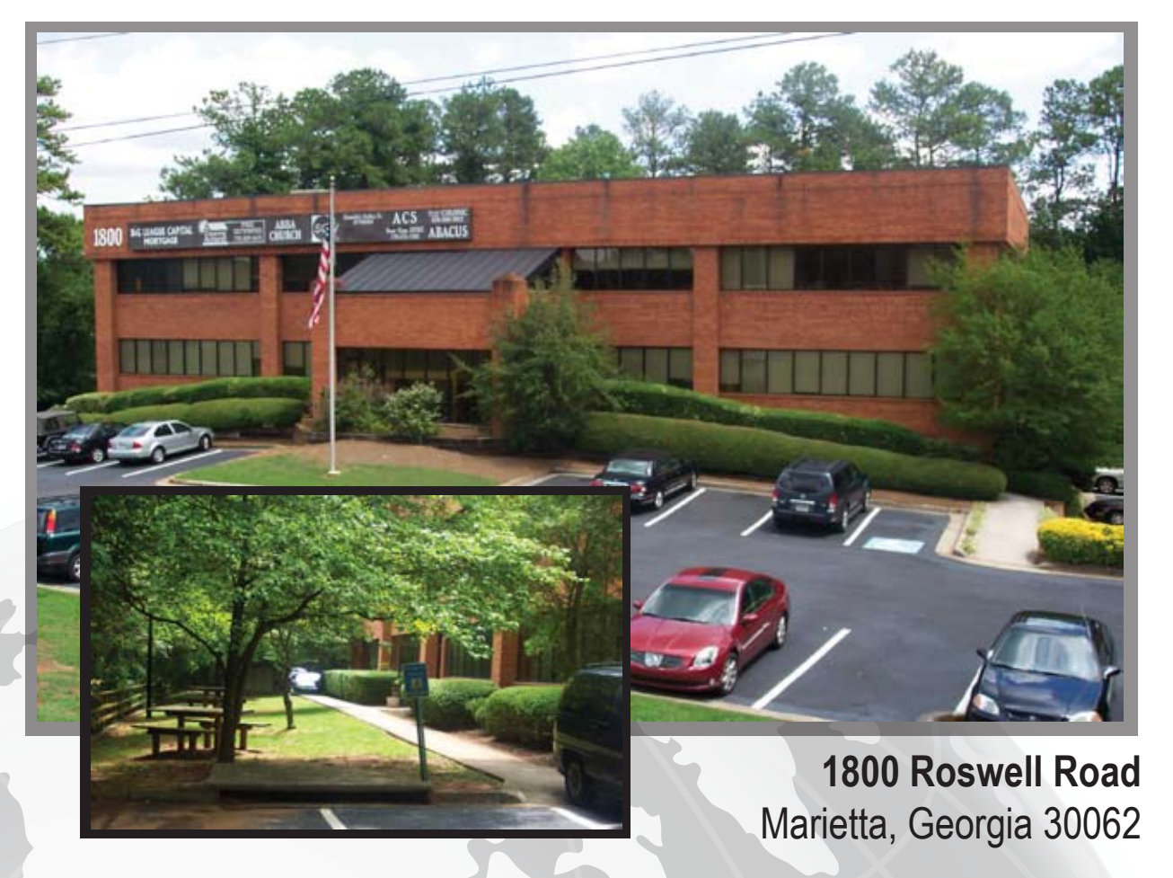
Up to 5,000 sq feet available