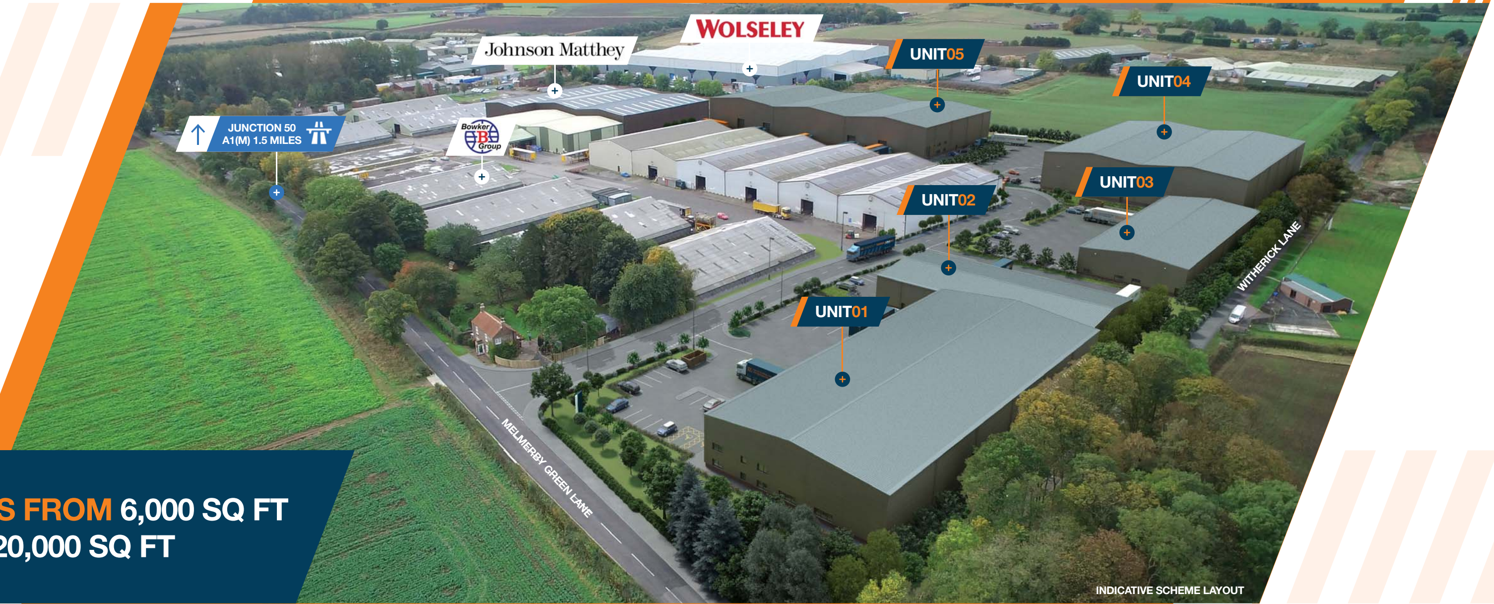
INDICATIVE SCHEME LAYOUT