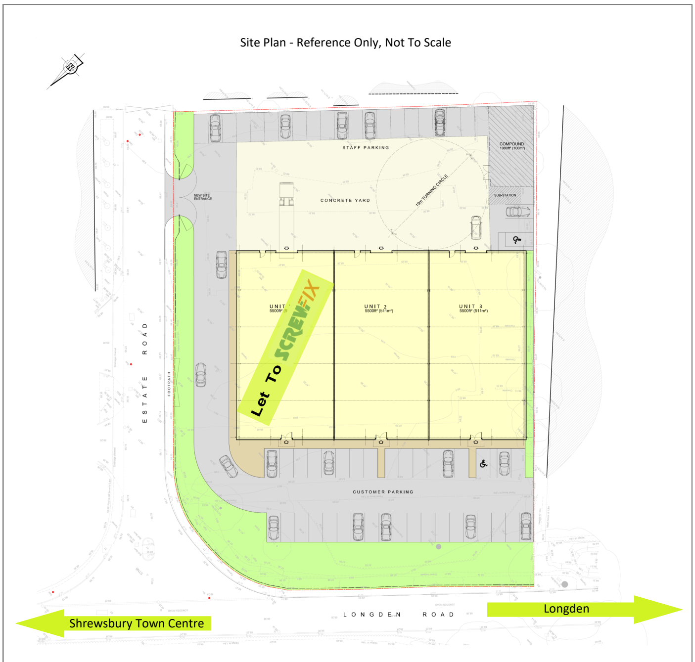
Site Plan - Reference Only, Not To Scale

By arrangement with Cooper Green Pooks – ask for Charles Howell cth@cgpooks.co.uk or Lizzy McNally elizabethmcnally@cgpooks.co.uk 01743 276666