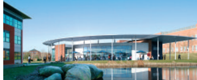
Proposed Amenity Building (CGI)