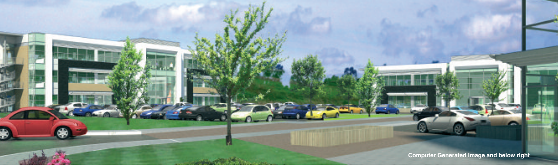
Computer Generated Image and below right