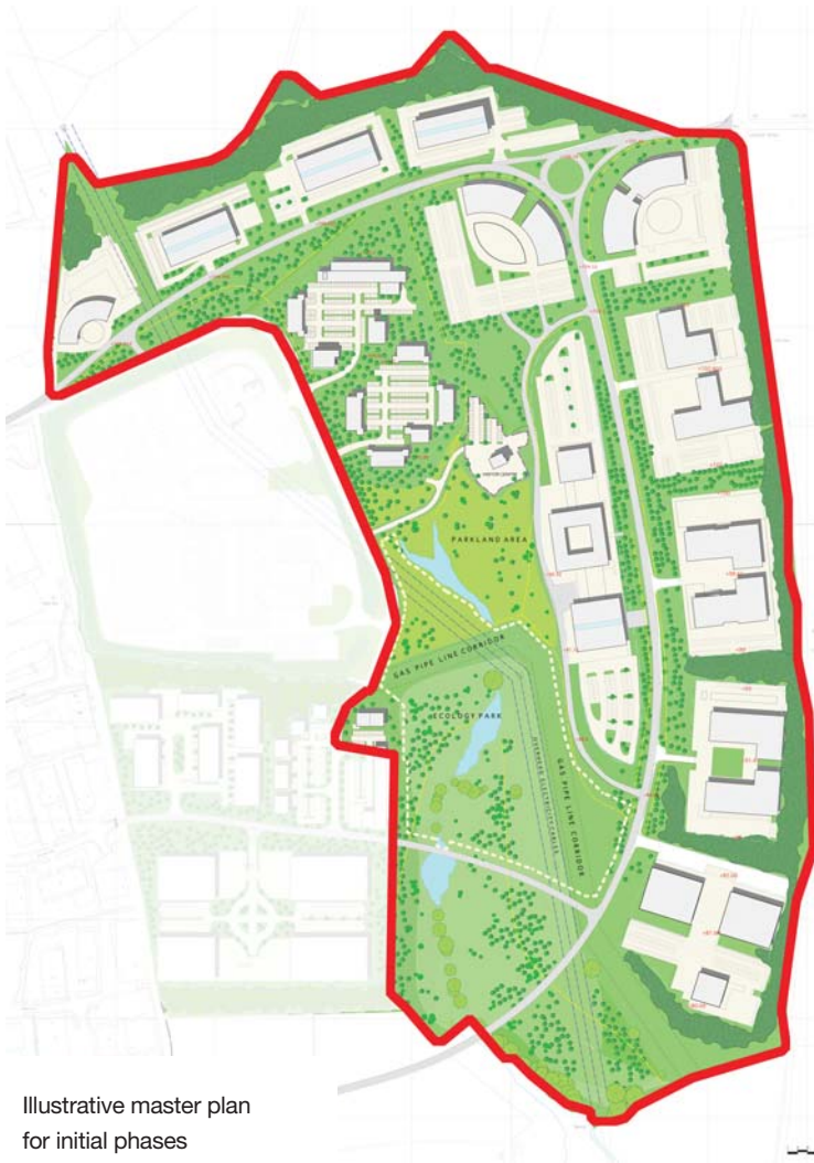
Illustrative master plan for initial phases