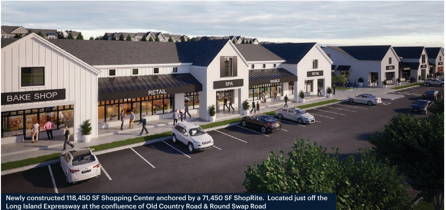
Newly constructed 118,450 SF Shopping Center anchored by a 71,450 SF ShopRite. Located just off the Long Island Expressway at the confluence of Old Country Road & Round Swap Road