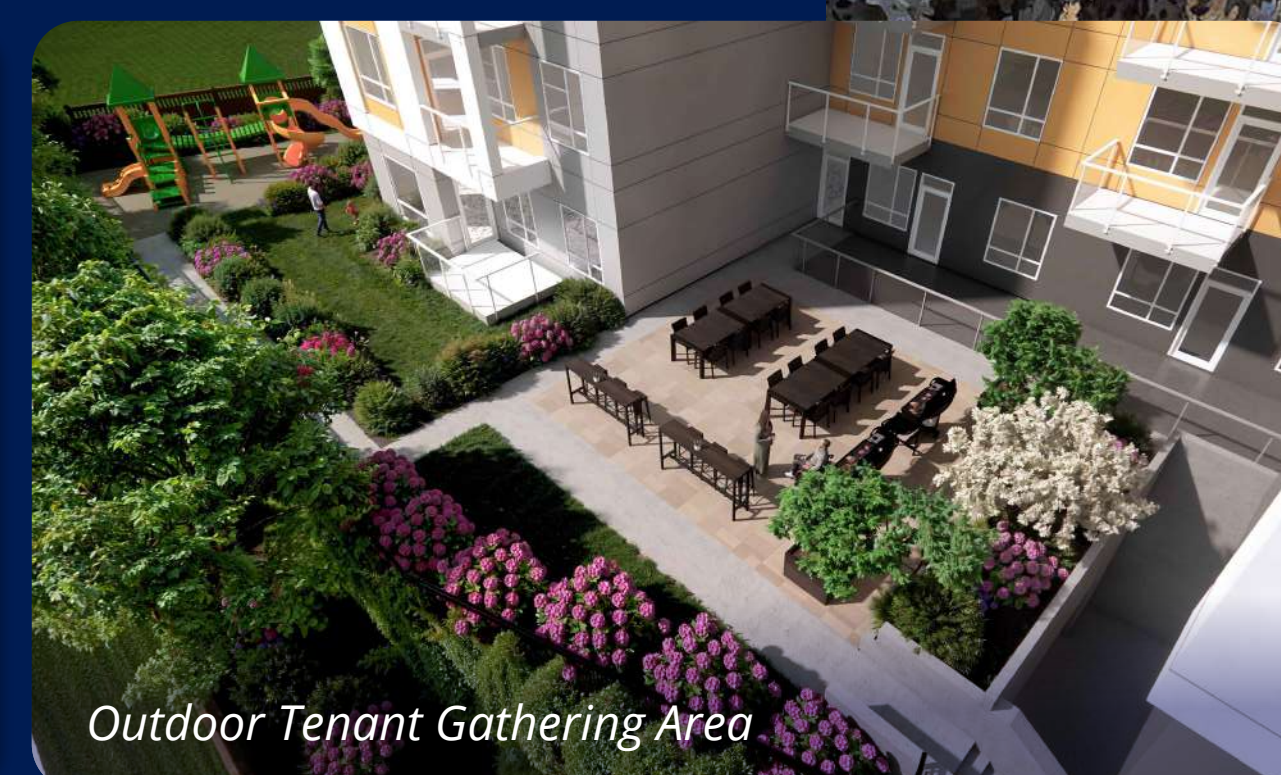
Outdoor Tenant Gathering Area