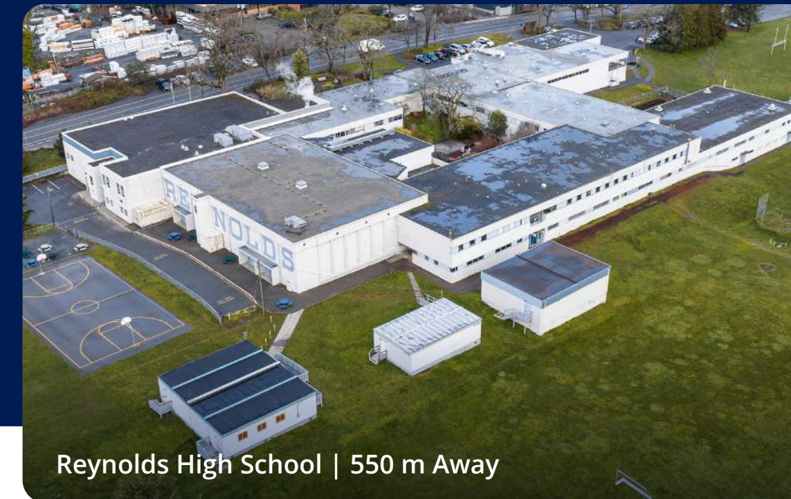
Reynolds High School | 550 m Away