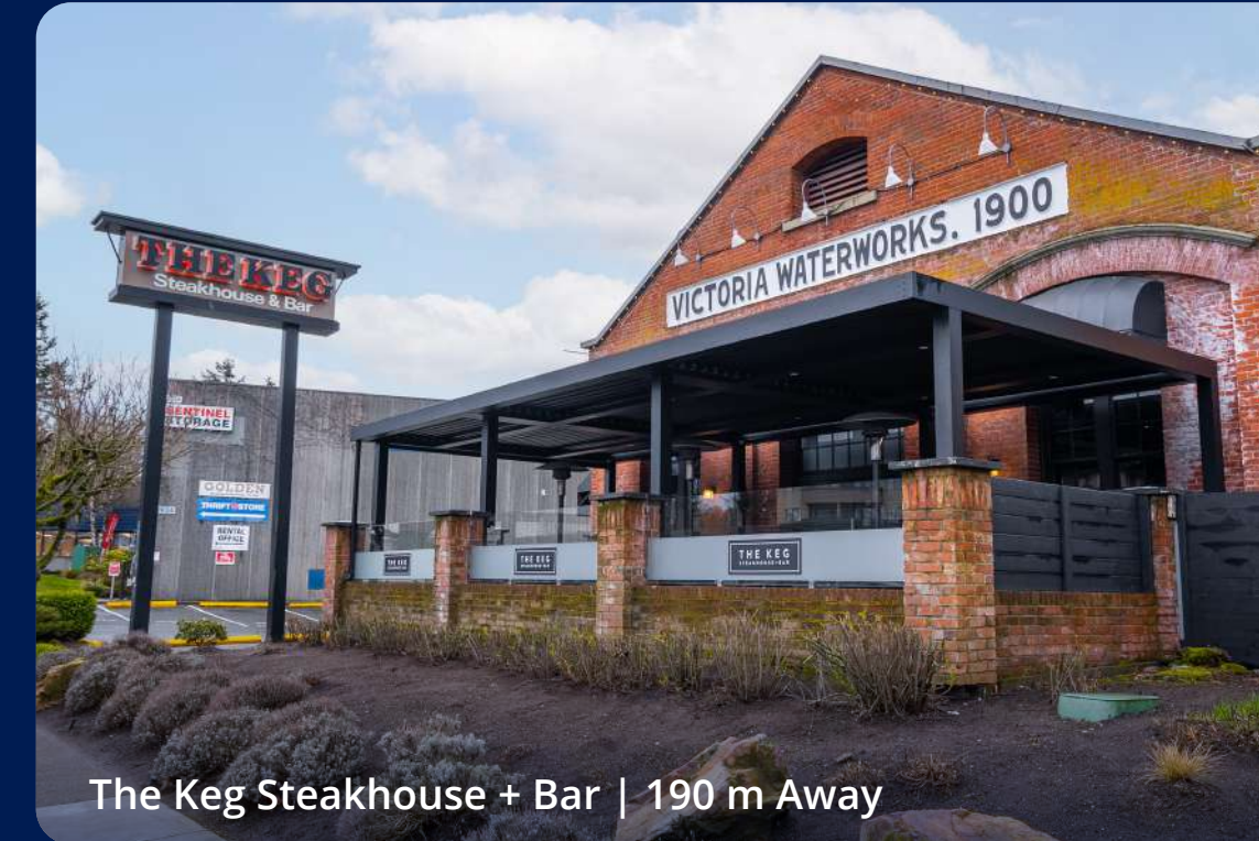
The Keg Steakhouse + Bar | 190 m Away