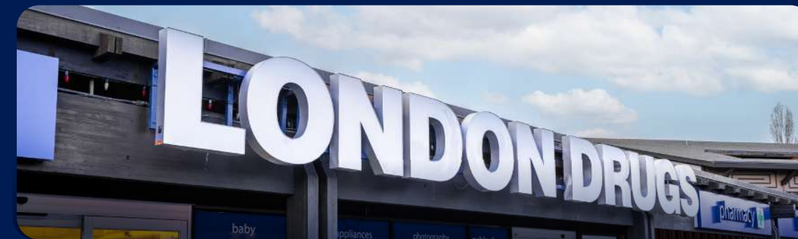
Saanich Centre | 700 m Away

The immediate area is surrounded by multi-family developments, contributing to a stable and highly desirable rental community.