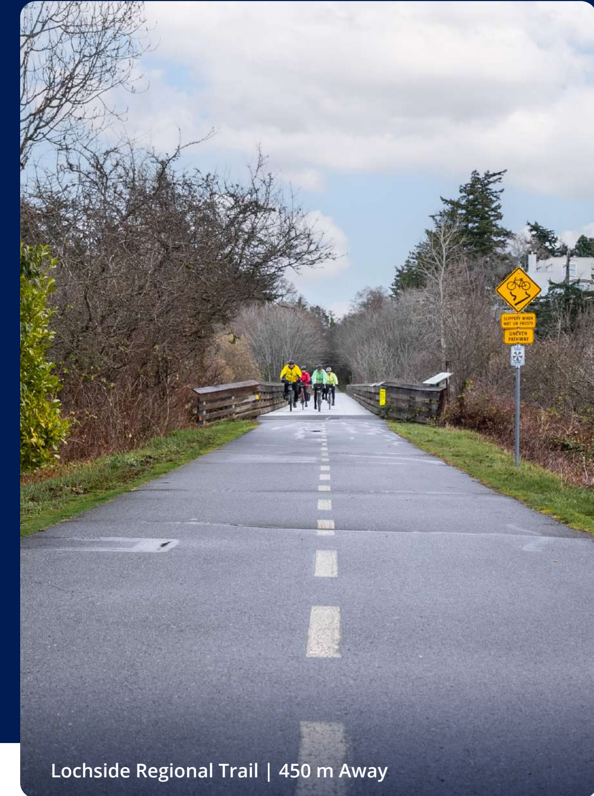
Lochside Regional Trail | 450 m Away