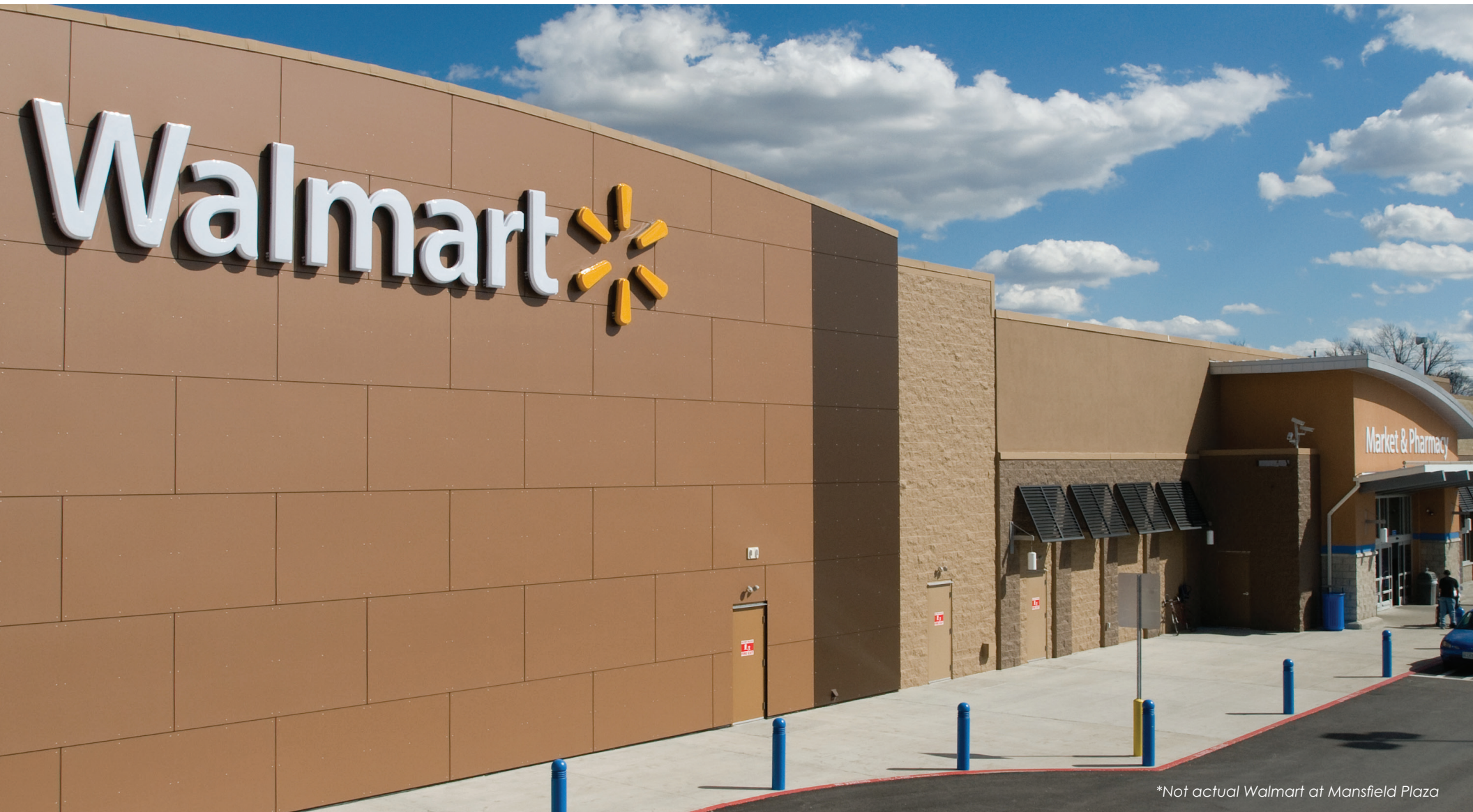
*Not actual Walmart at Mansfield Plaza