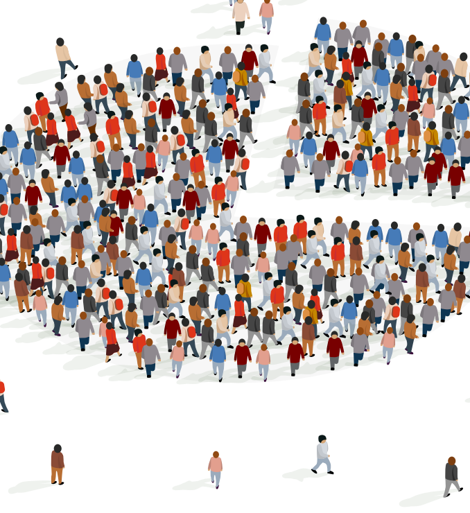
Per Capita & Avg Household Spending