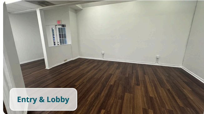
Entry & Lobby