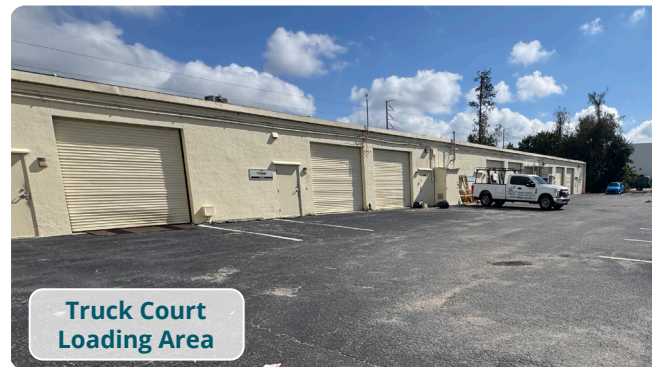
Truck Court Loading Area