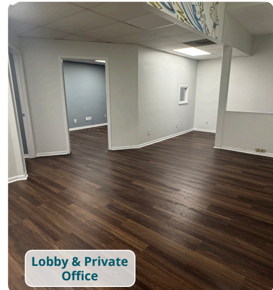
Lobby & Private Office