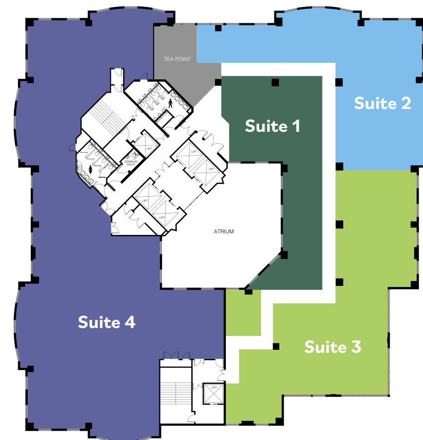
3rd Floor Suites

Available on inclusive terms which include: rent, service charge, insurance and new furniture if required.