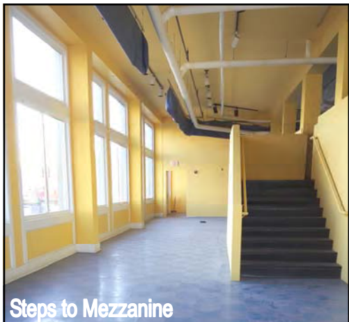
Steps to Mezzanine