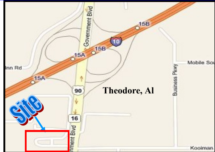
Area Map: Directions from I-10. Take exit 15 to Hwy 90 west. Turn left at first traffic light into park (Sermon Rd)