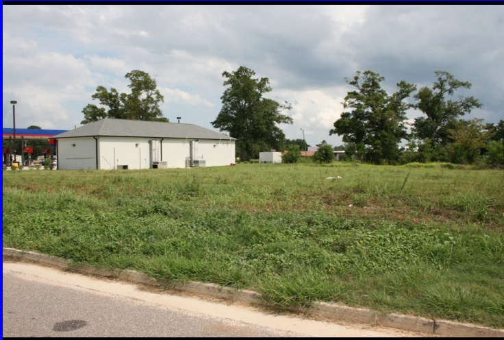
Lot #3 Located behind the Race Track Gas Station. Located in the front of park