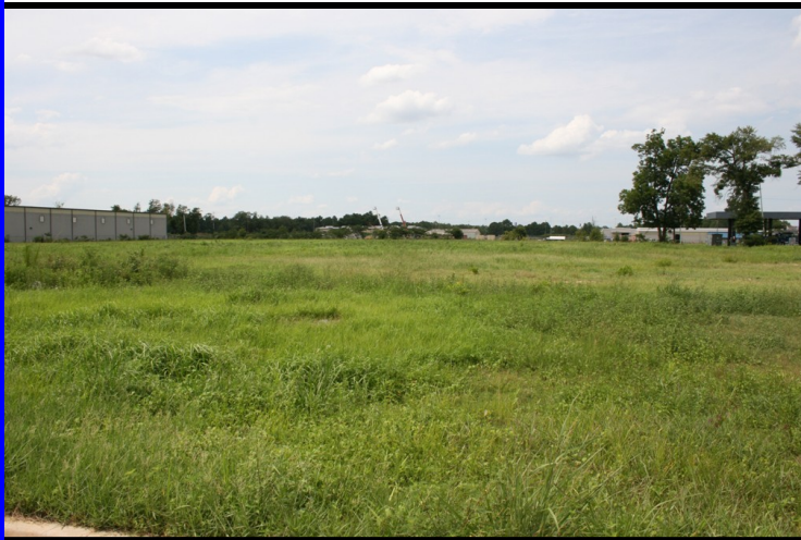
Lot 18 + 17