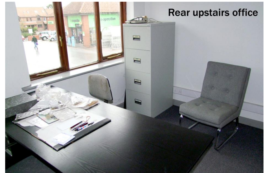
Rear upstairs office

Viewing is strictly by appointment only. Please contact Jasper Caudwell at Pygott & Crone on: Tel: 01205 359900 Mobile: 07795 358878 Email: jcaudwell@pygott-crone.com