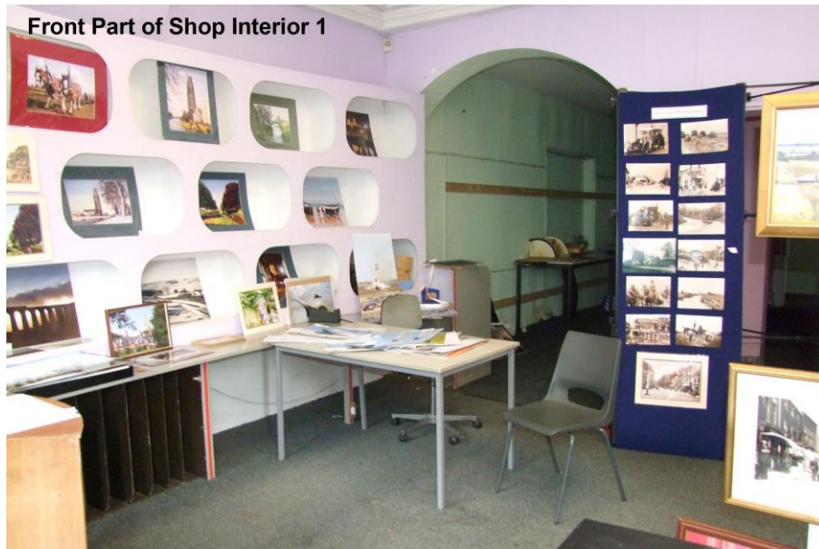
Front Part of Shop Interior 1