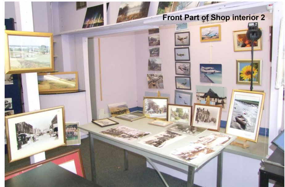
Front Part of Shop interior 2