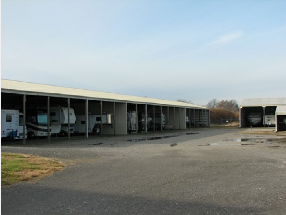
Here they Come