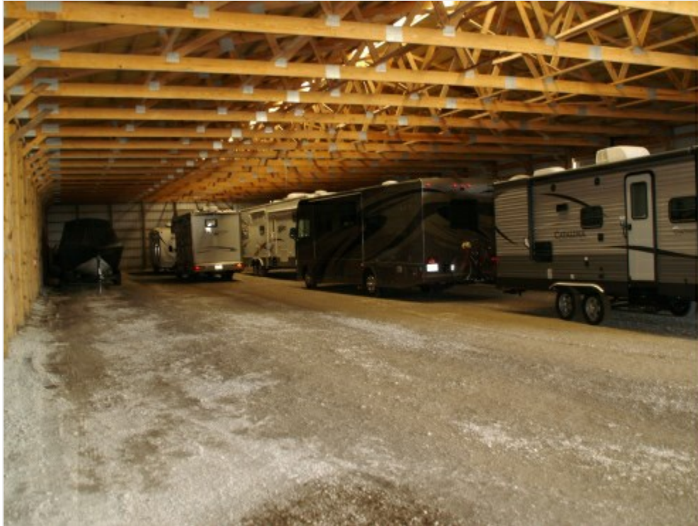
Enclosed warehouse w/ rock floor