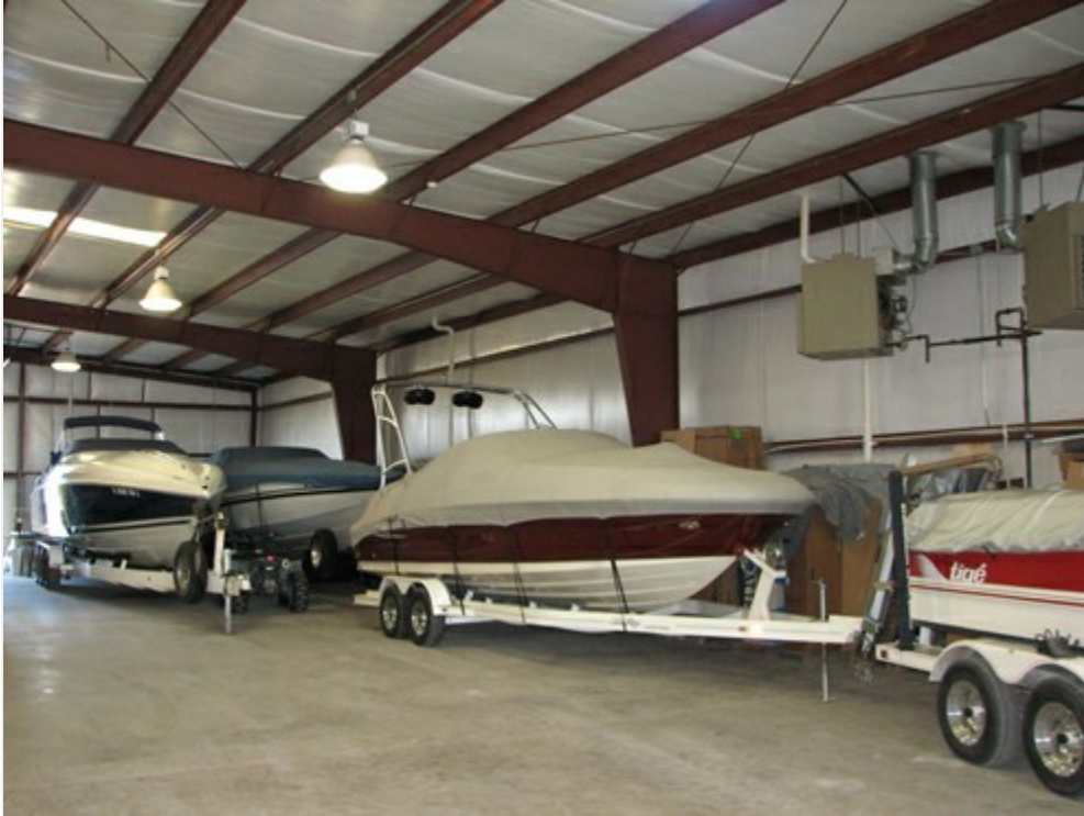
Home for Big Boats