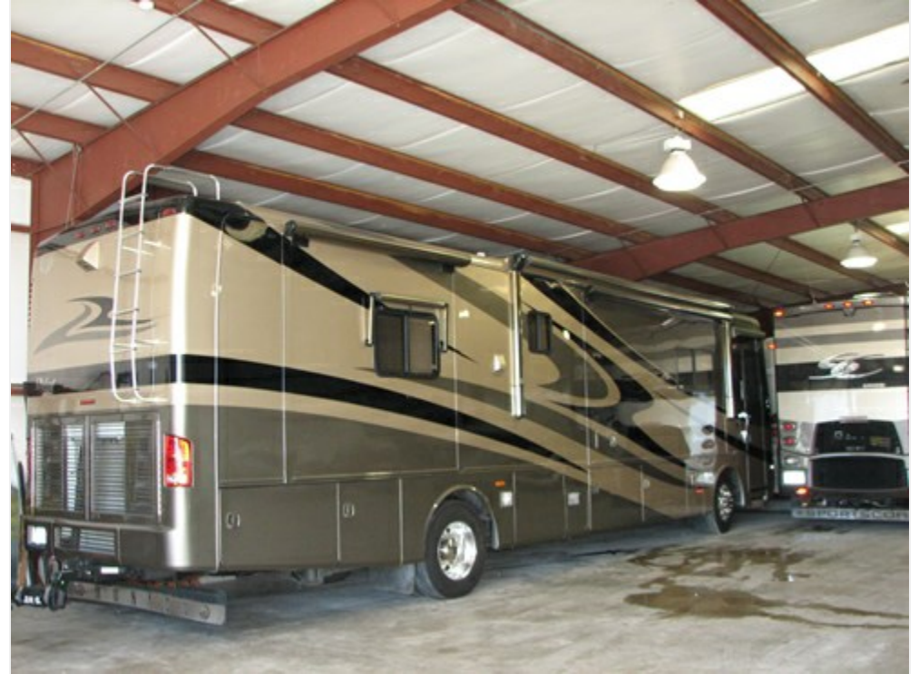
Plenty of Inside Storage