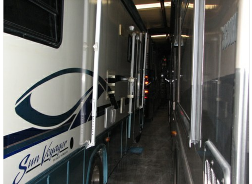
Units Clean and Ready for Winter