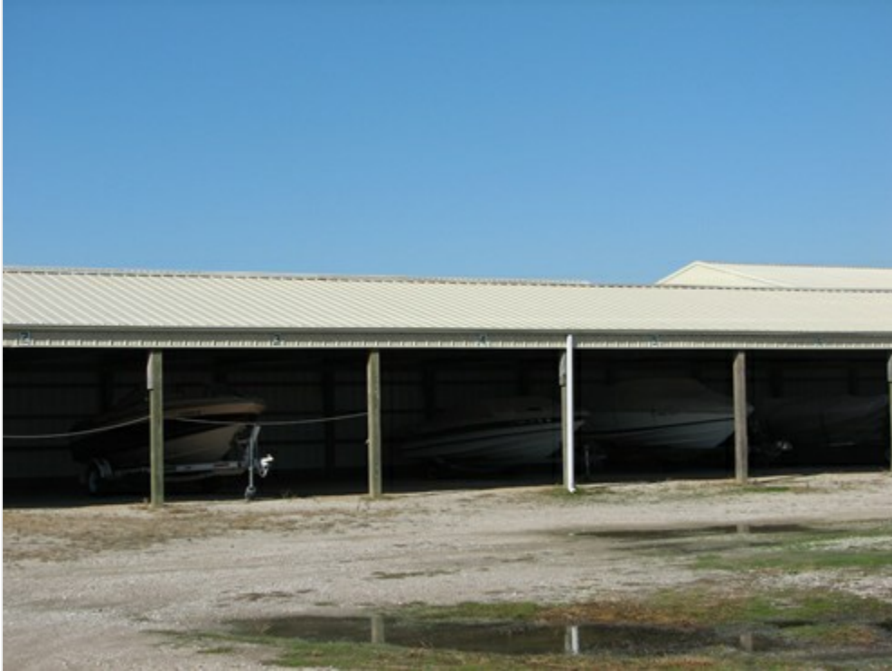
One of Nine Large Storage Buildings