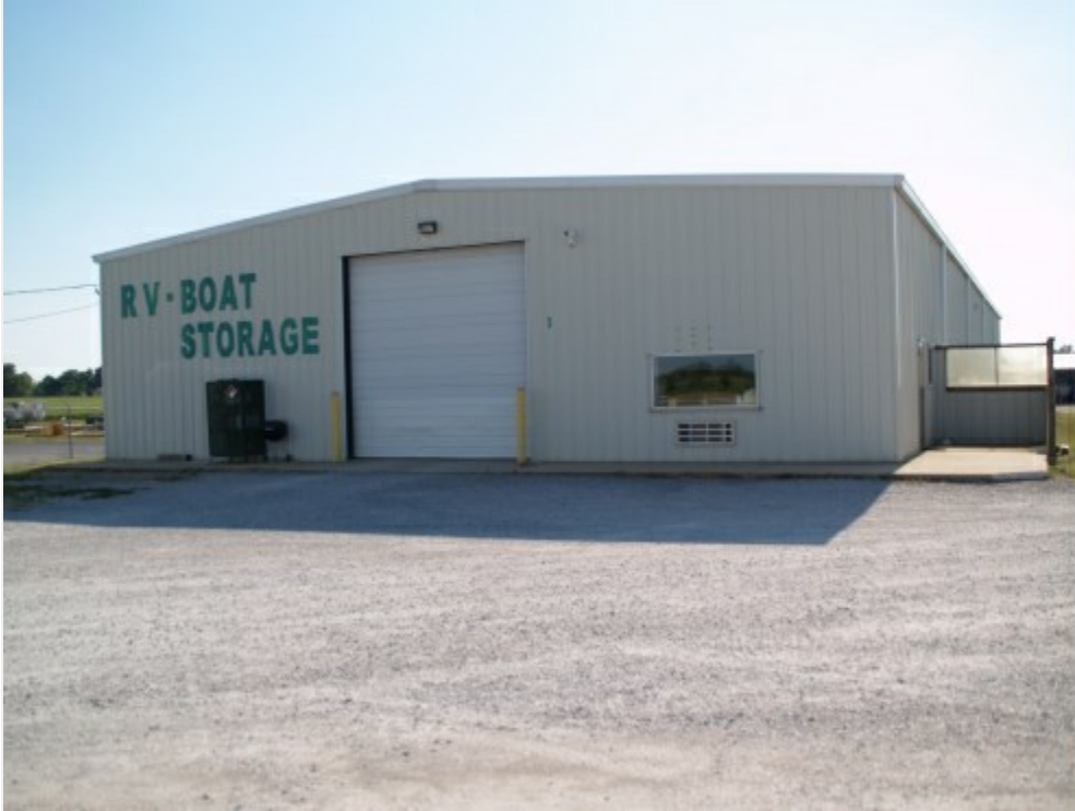
Front elevation of main building