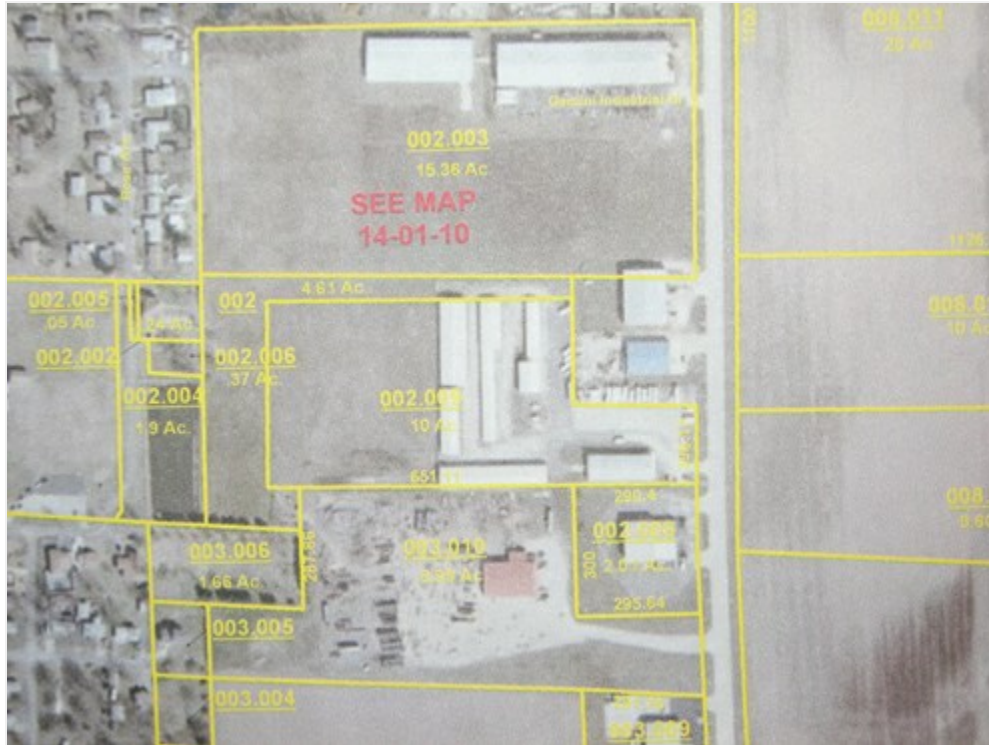
4615 Hedge Road Just South of Exit