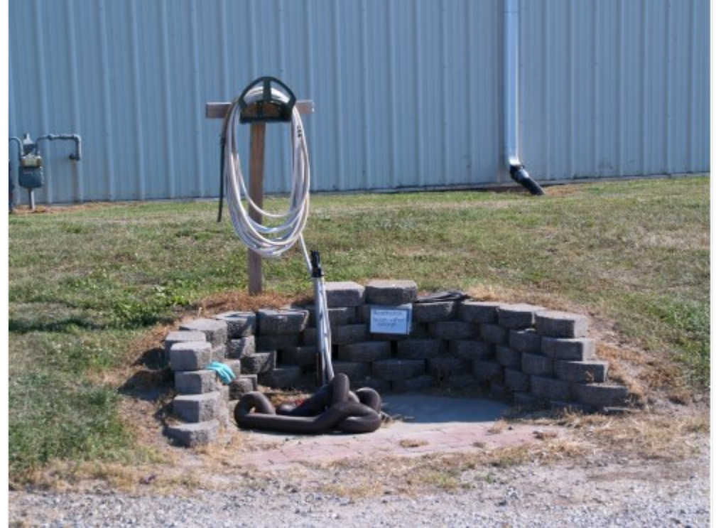
Clean out area for RV's