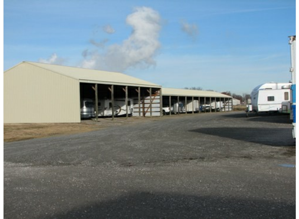
Is Your Vehicle In Here?