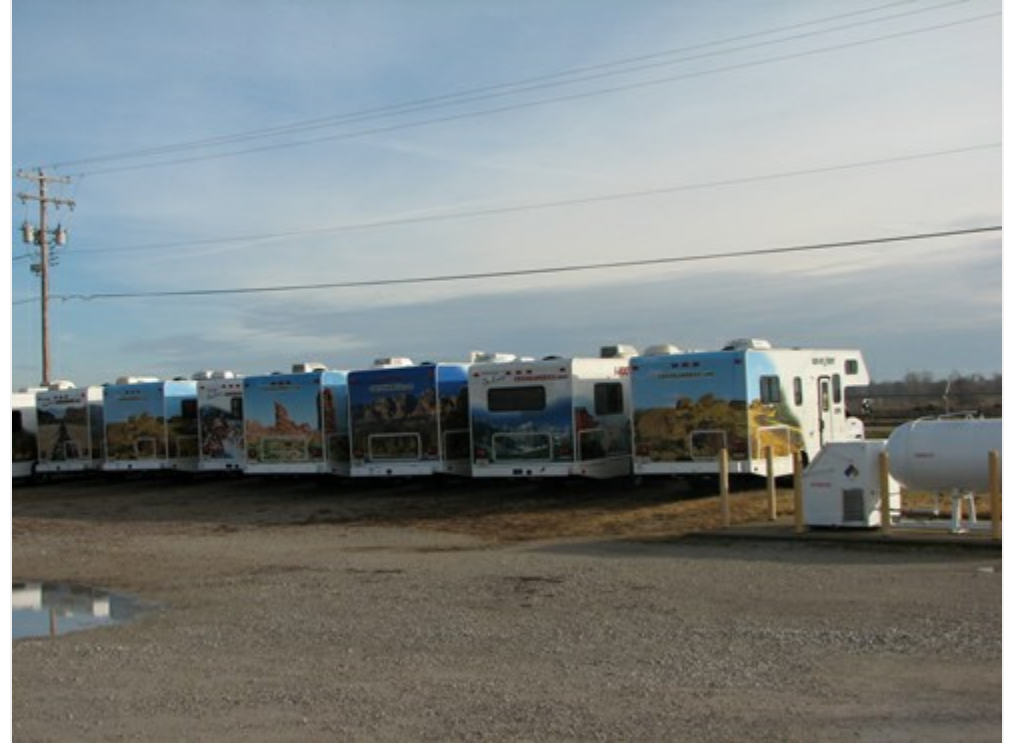
All Units in For Winter