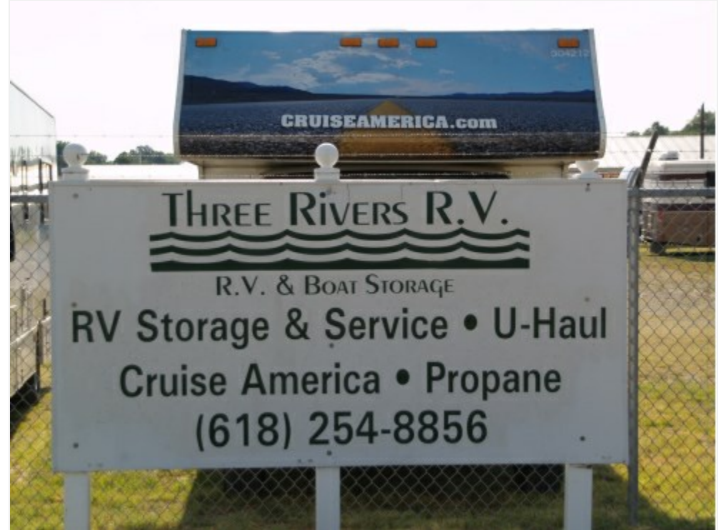
Other services offered as well