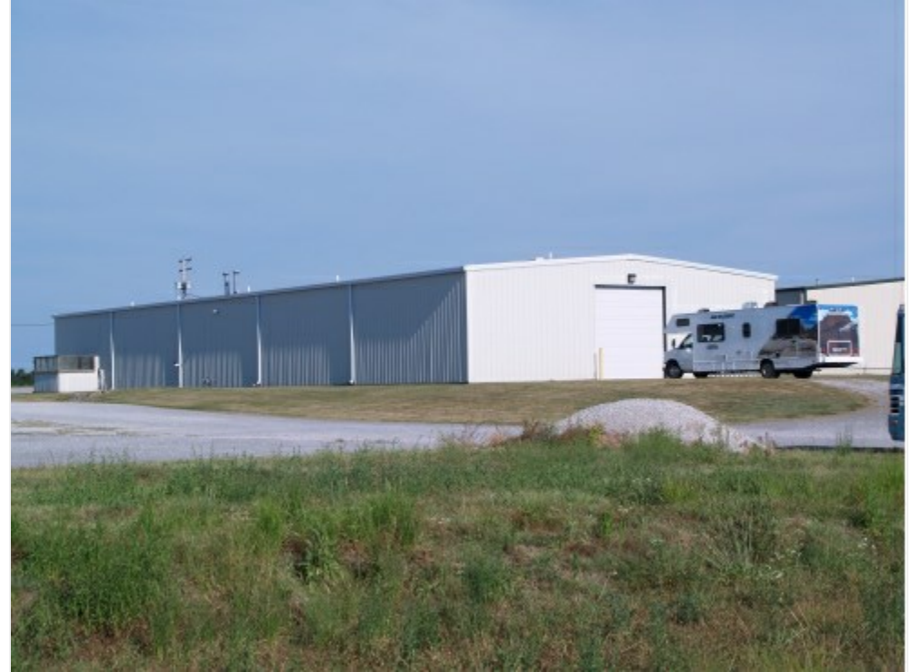
Main building w/ drive thru