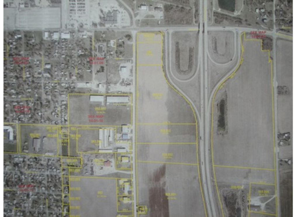
I255 at Madison Avenue