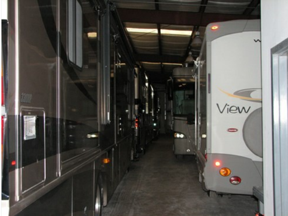
Tight Storage Until New Buildings Built