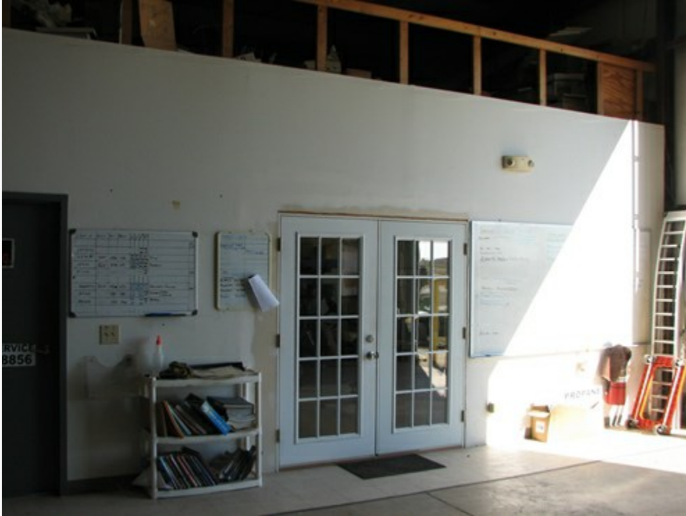
Over 600 Square Feet Office Space