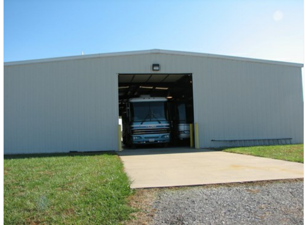
Drive Through Building