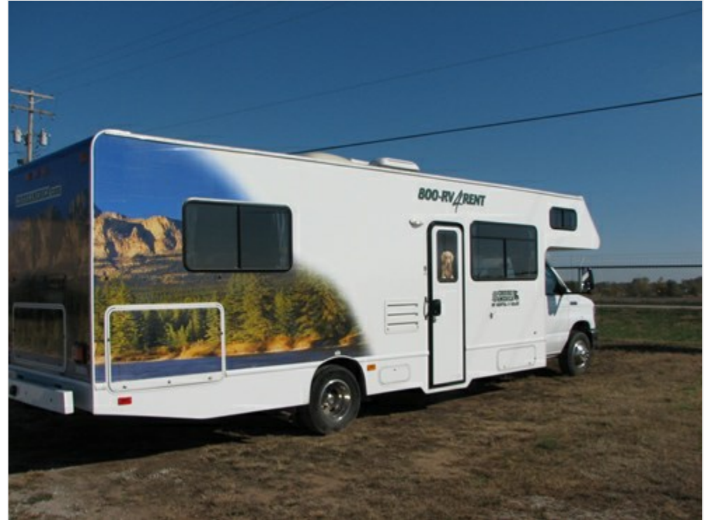
Cruise America Vehicle