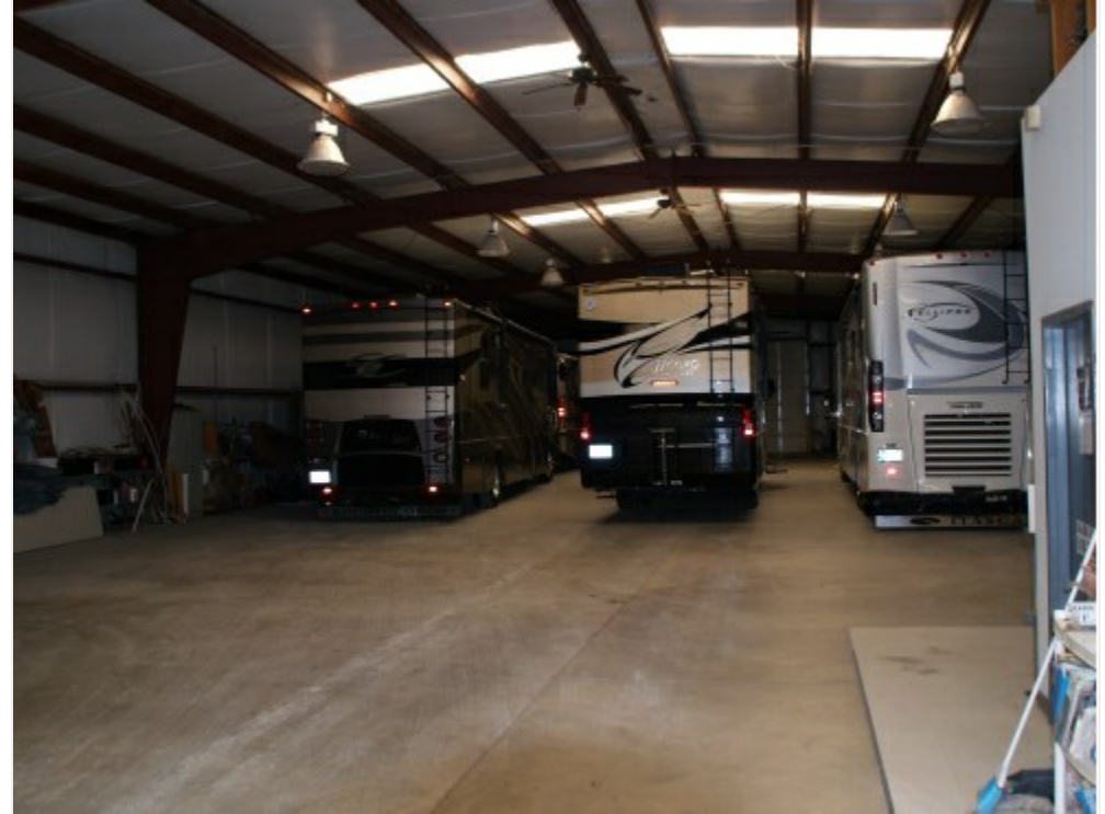
Temp controlled warehouse