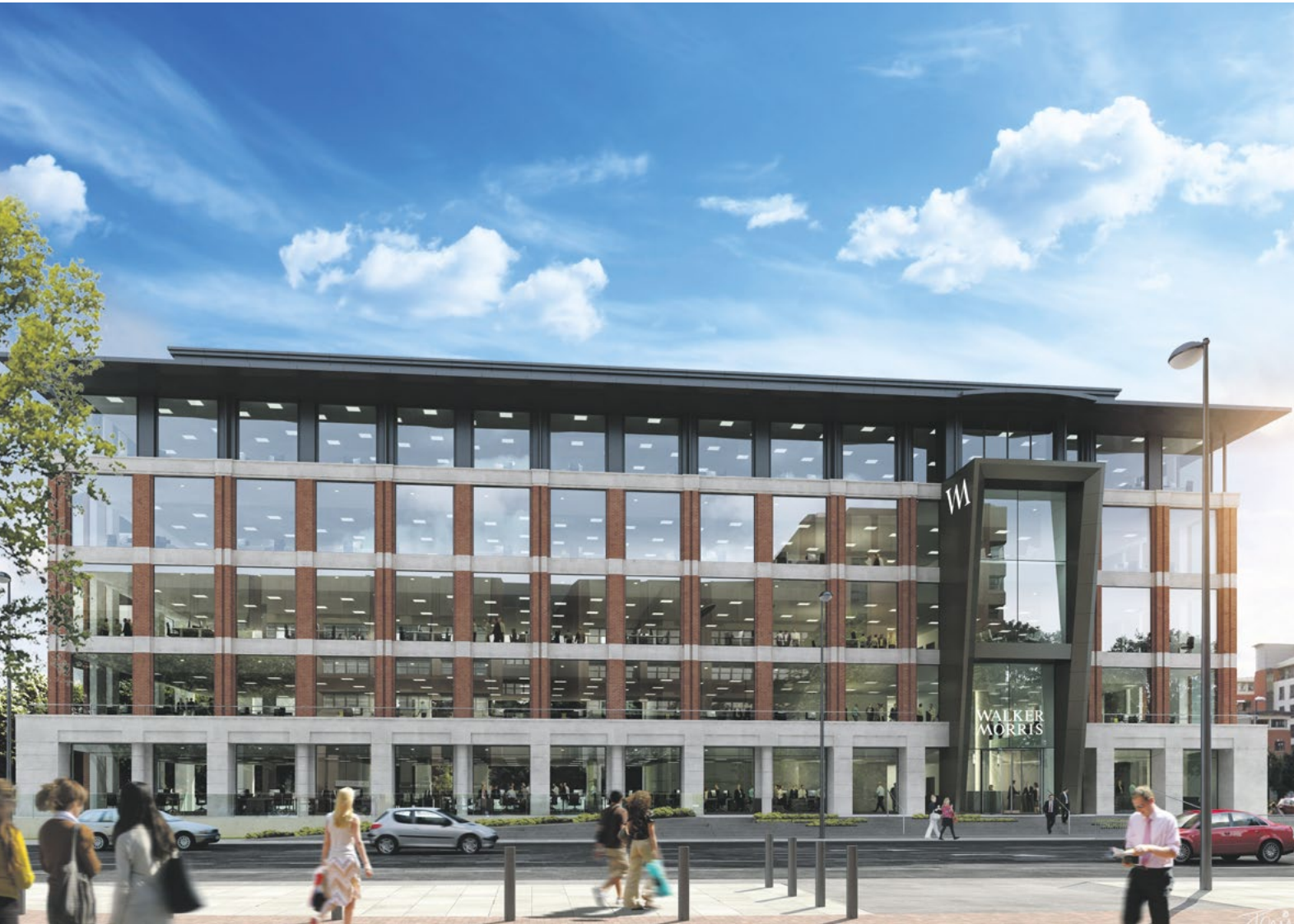
GROUND FLOOR 7,117 SQ.FT. (661 SQ.M.)