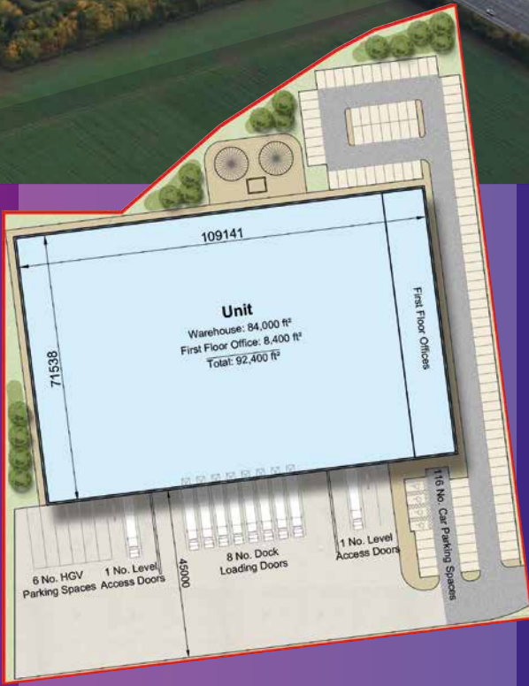
92,400 sq.ft (8,584 sq.m)