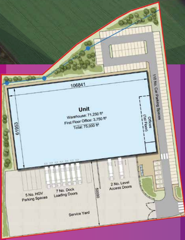
75,000 sq.ft (6,968 sq.m)