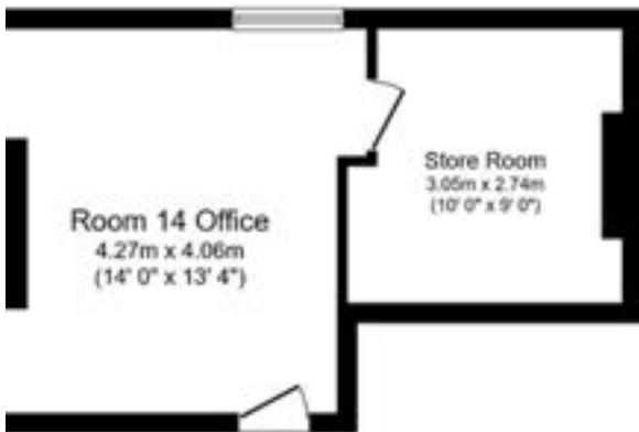
Room 14 Floor area 25.6 sq.m. (276 sq.ft.)

Earley Station is a short drive away, providing regular services to Reading and London Waterloo, and the A329M and Junctions 10 & 11 of the M4 are easily accessible. Local shops, cafés and amenities are also close by.