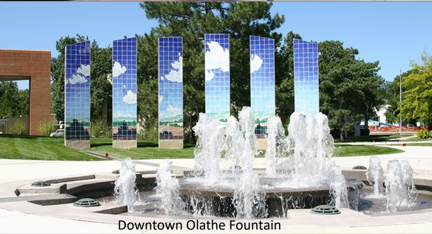
Downtown Olathe Fountain