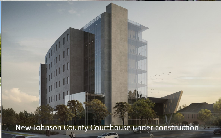
New Johnson County Courthouse under construction