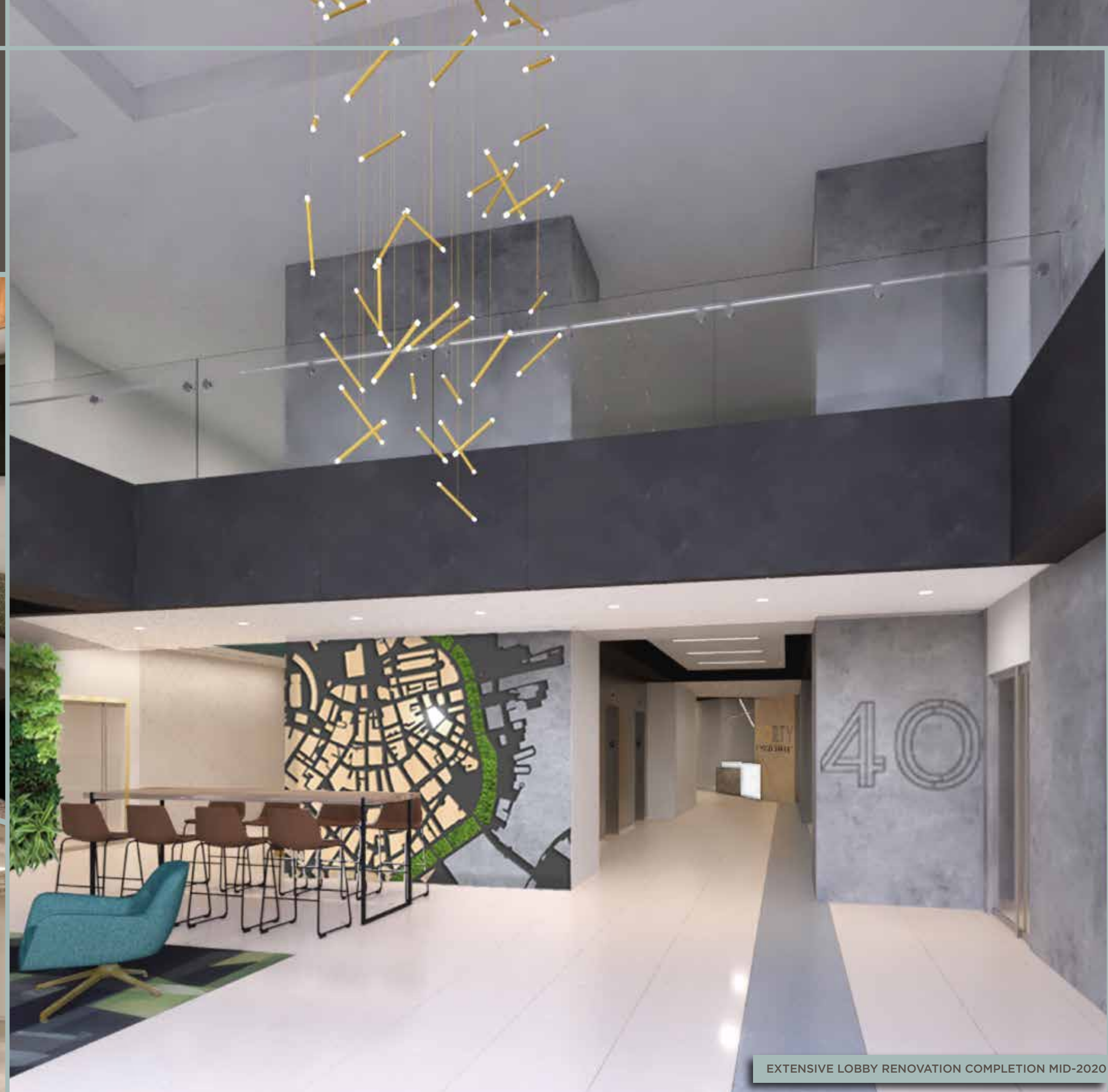
EXTENSIVE LOBBY RENOVATION COMPLETION MID-2020