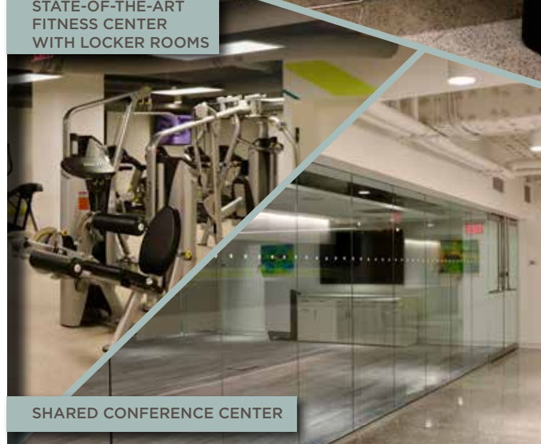
SHARED CONFERENCE CENTER