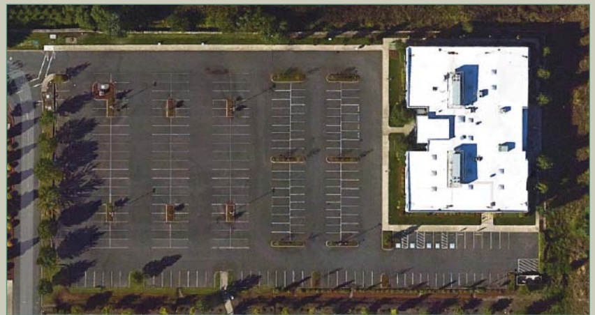
Excellent shared parking.

Information contained herein has been obtained from the owner of the property or from other sources that we deem reliable. We have no reason to doubt its accuracy, but we do not guarantee it. All information is subject to change without notice.