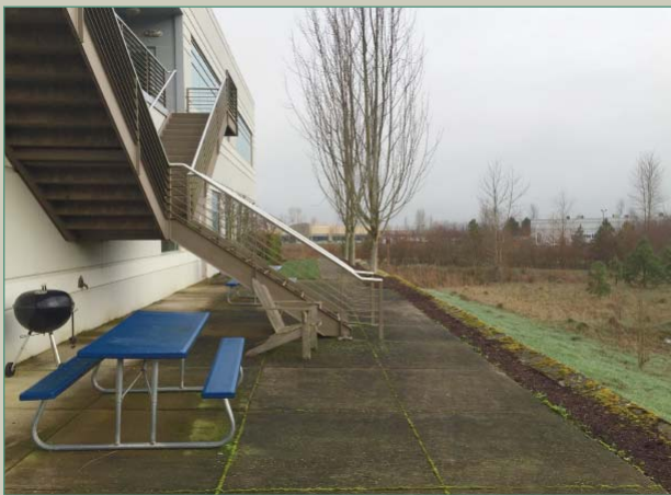
Back patio overlooking the wetlands area.