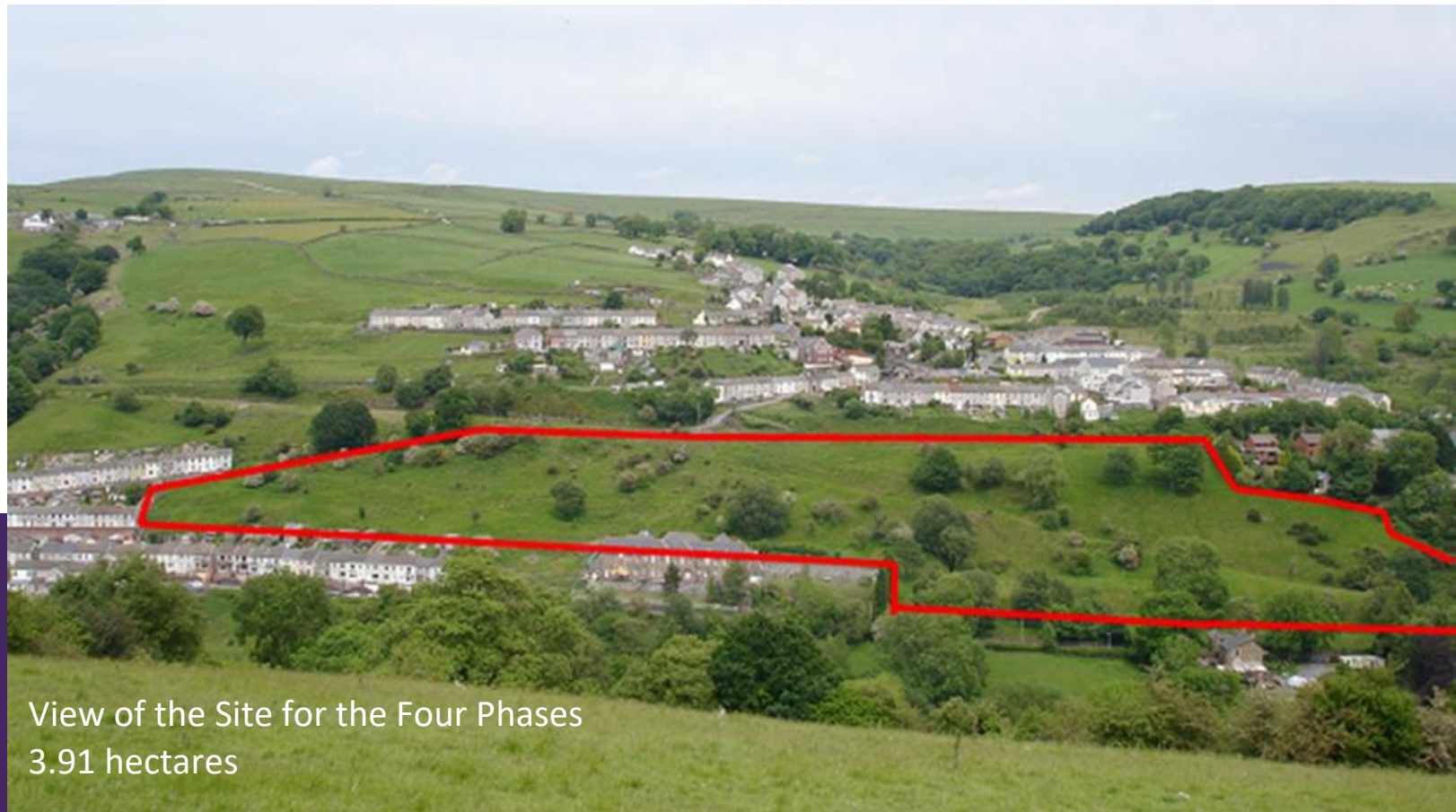
View of the Site for the Four Phases 3.91 hectares