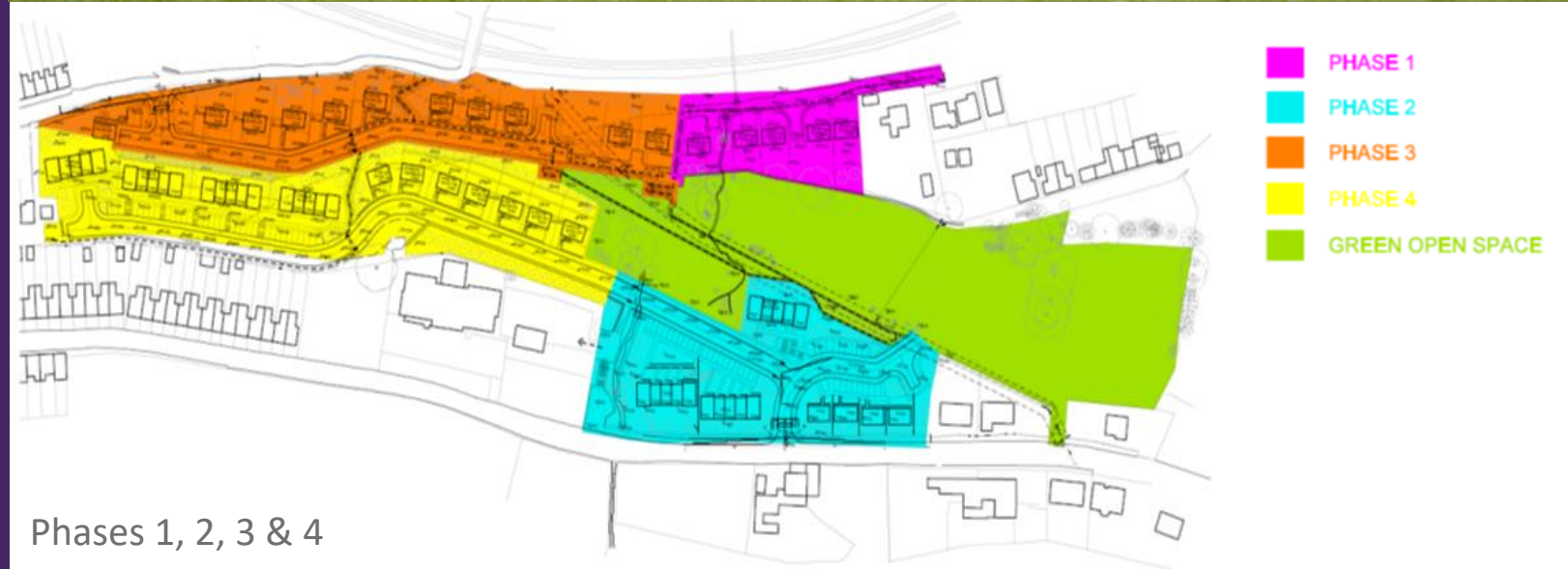
Phases 1, 2, 3 & 4