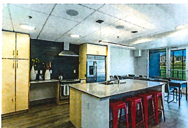
Community Kitchen & Lounge

Unique & Efficient Live/Work Apartment Homes with Designer Finishes & Flexible Layouts Fantastic visibility from busy MLK & S Alaska intersection Convenient Living at Sonata with Endless Amenities