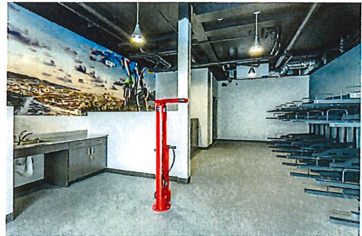
Secure & Heated Community Indoor Bike Storage