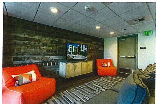
COMMUNITY MOVIE THEATER