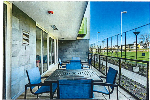
Heated Outdoor Community Patio