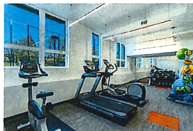
State of the Art Fitness Center