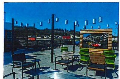
Roof-Top Terrace w/ TV's & BBQ's