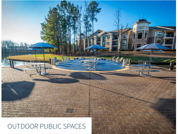
OUTDOOR PUBLIC SPACES