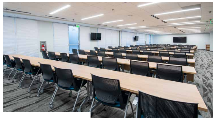
TENANT LOUNGE AND SHARED CONFERENCING