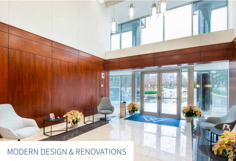
MODERN DESIGN & RENOVATIONS