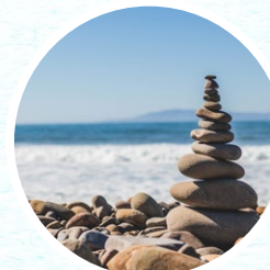
POWERHOUSE BEACH / PARK