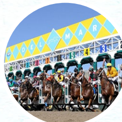
DEL MAR RACE TRACK