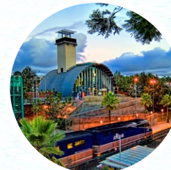
SOLANA BEACH TRAIN STATION