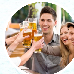
RESTAURANTS & CRAFT BEER