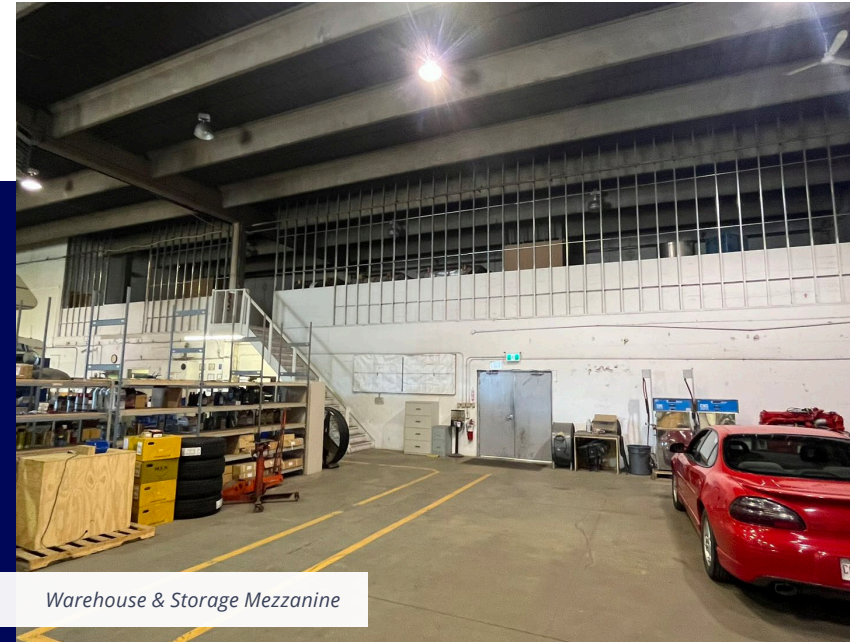
Warehouse & Storage Mezzanine