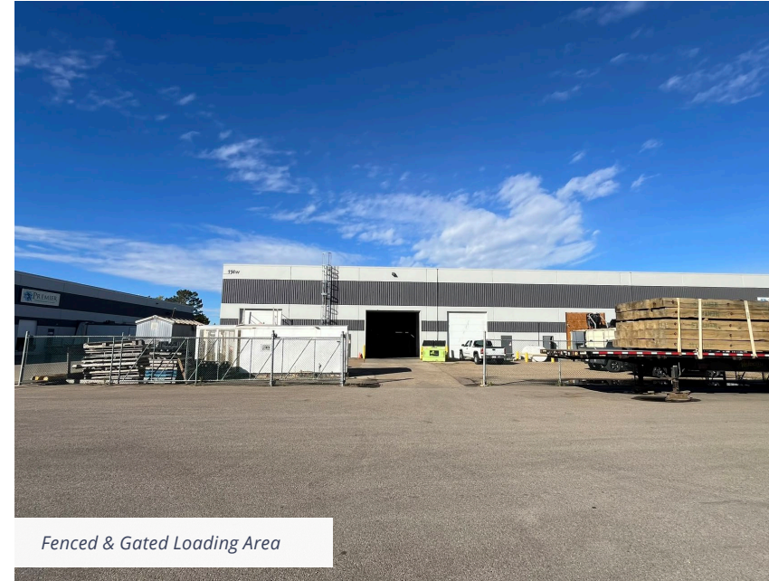
Fenced & Gated Loading Area