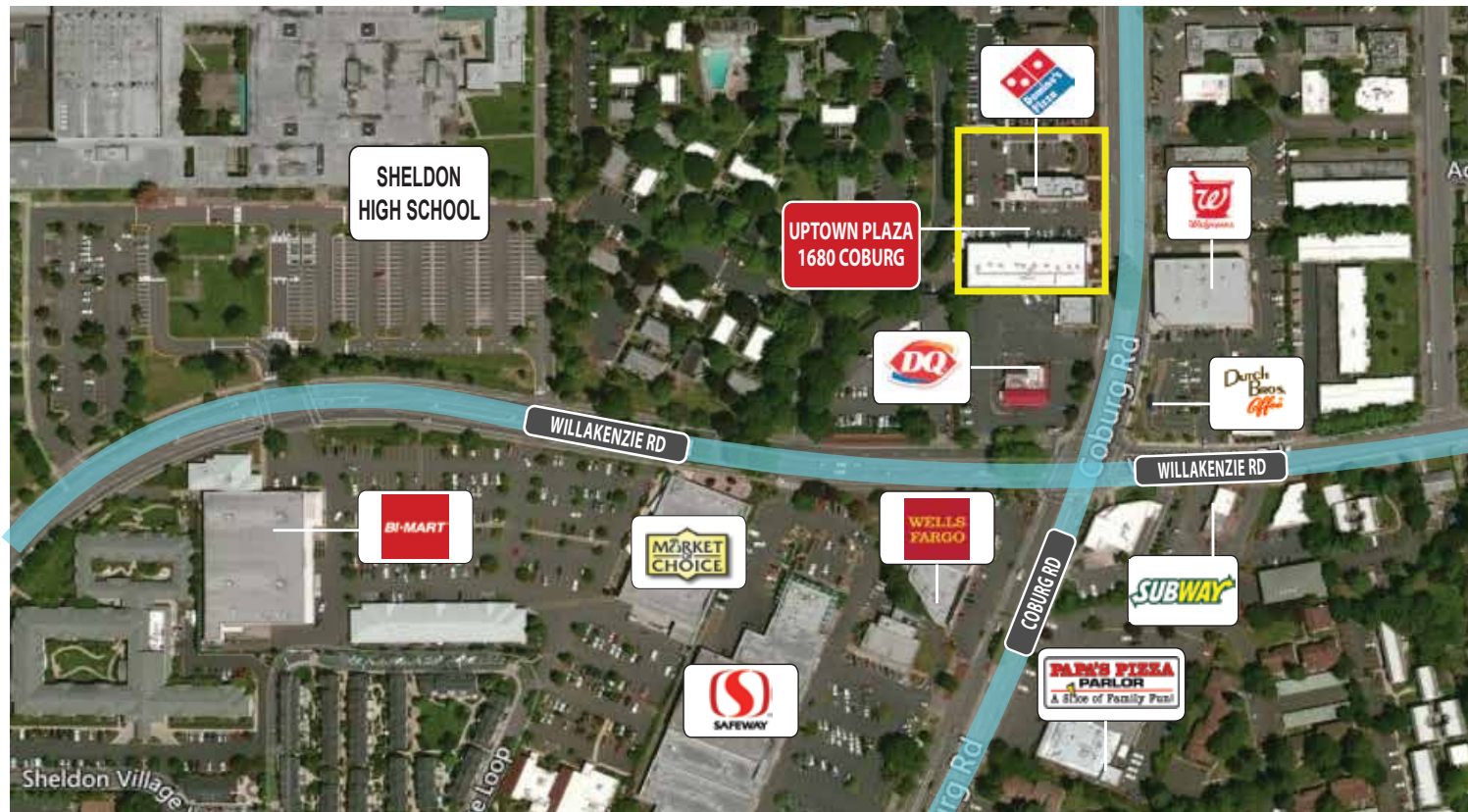
COBURG ROAD CORRIDOR TENANTS (with-in 1.5 mile distance of property site)

BI-MART MARKET OF CHOICE SAFEWAY WALGREENS COSTCO SHOPCO