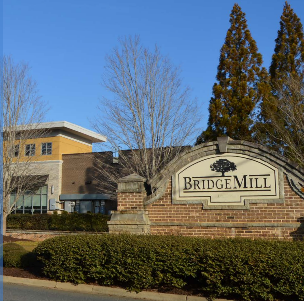
Entrance to Bridgemill Commons.