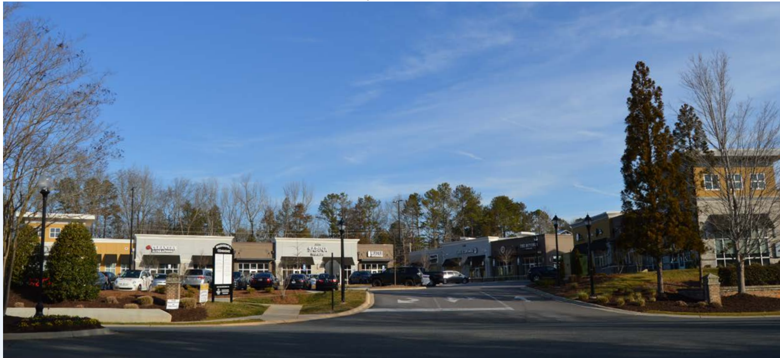
Bridgemill Commons Shopping Center (front).

Sip and Paint/ and Comedy Club The Magic Canvas