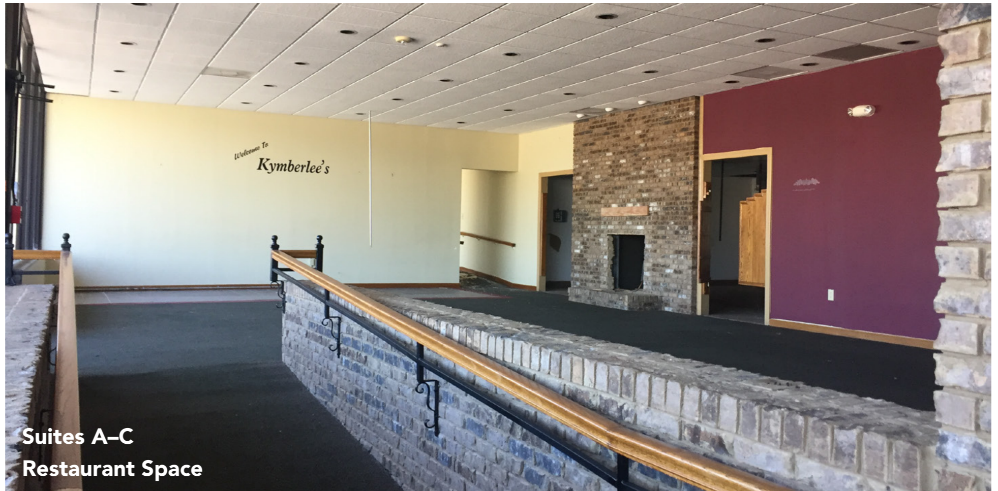
Suites A-C Restaurant Space