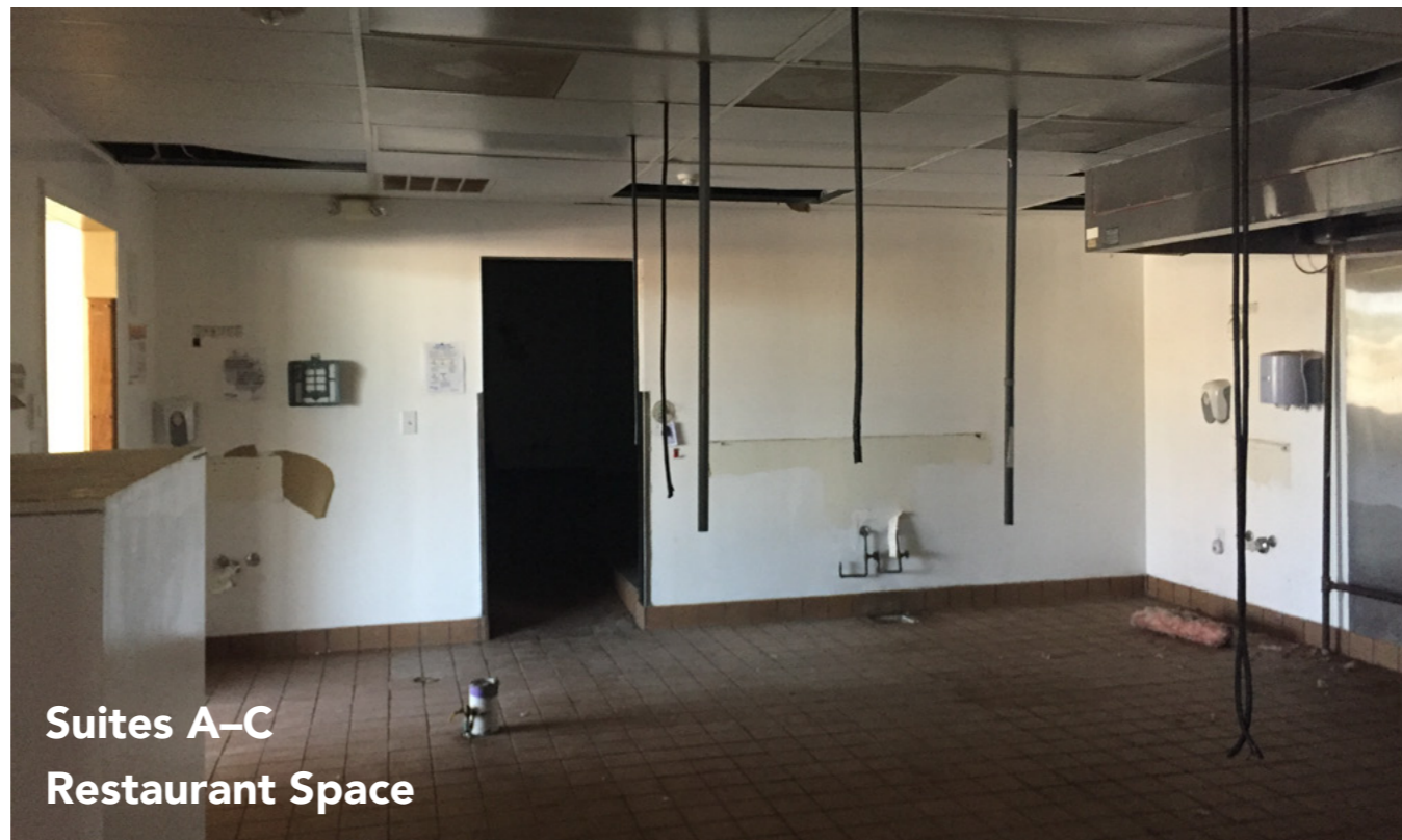
Suites A-C Restaurant Space