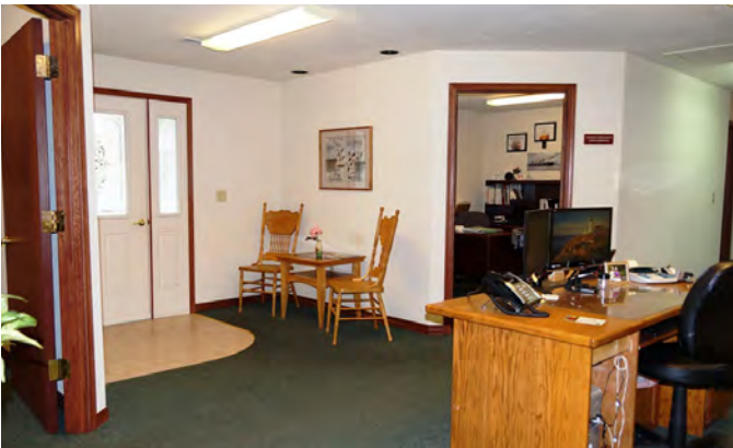
Office Reception Area