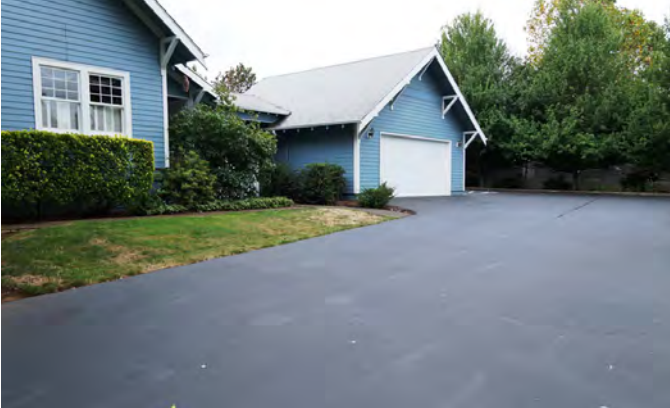
Side of residence leading to parking spaces for office