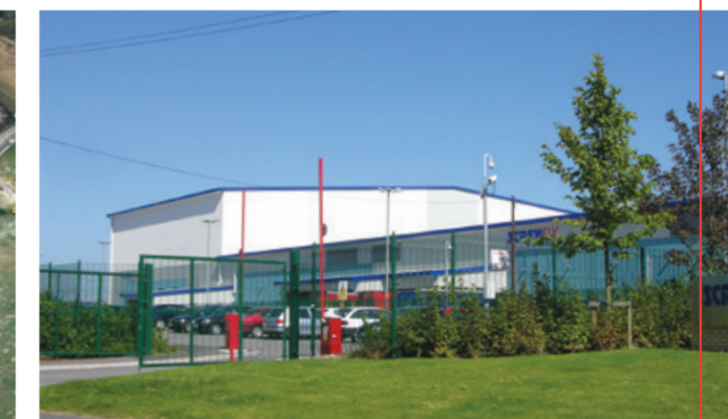
All building photography shows current St. Modwen sites and is indicative only.